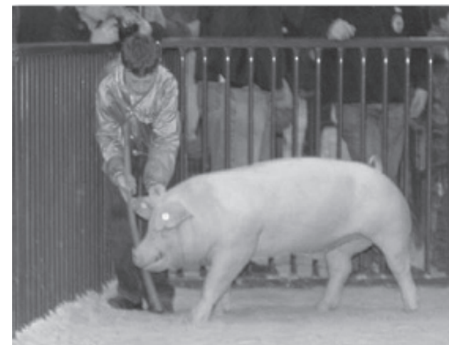
Figure 4. Use your driving tool along with your hands to help get your pig out of the ring corner.

sharply. Good showmen are constantly looking for openings in the ring to drive their hog, keeping their pigs off the fence, away from groups of pigs and out of corners.