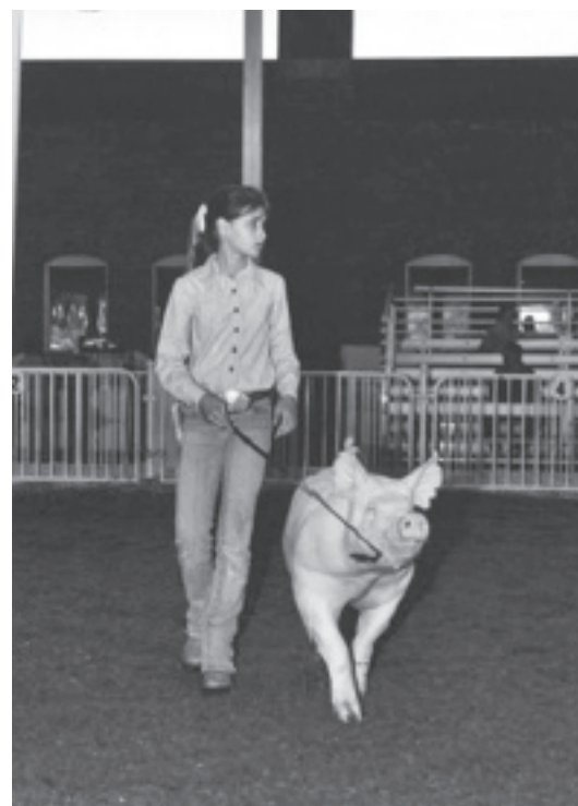
Figure 2. Naturally move your hog around the ring with its head up. Finding open areas will help get your pig noticed.

There is no halter used when showing a hog. Instead, exhibitors must drive their hog with complete confident control for the judge to appraise the animal.