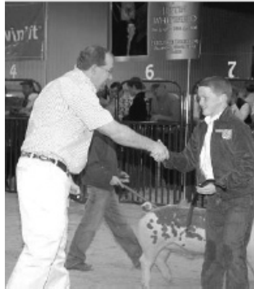
Figure 5. Showing hogs is a very rewarding experience. Show appreciation to those who have helped you succeed.

Always be courteous to show officials, the judge, and other exhibitors (Figure 5). Good sportsmanship is an important part of showmanship; therefore, you will win graciously and accept setbacks with dignity. Show your appreciation for the sponsorship of the show by writing thank you notes. Be a