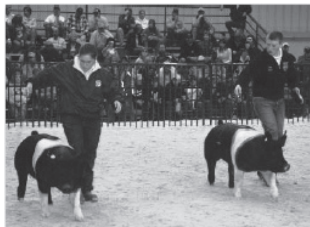
Figure 3. Keep your hog between you and the judge at all times. Tell your hog which direction to turn by use of the driving tool.

By the time you arrive at the show, your hog should already be trained to drive and act correctly. Observe where you are going in the show ring and look to see that you are driving your pig in the open areas with adequate distance from the other hogs. Walk at a moderate pace and straight ahead with the hog's head up in the air (Figure 2). During the drive, the hog's head should be just high enough to present an impressive style, attractive side view and graceful walk. Working on keeping the head up should not be carried to extremes that can be distracting or that keep your hog from moving out at a good pace. Let your hog walk out freely and naturally, not too fast and not too slow, never turning the pig