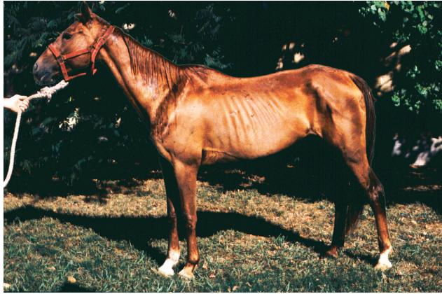
Picture 1. Horse in a body condition score 1. Note skeletal features evident in areas of normal fat deposition.