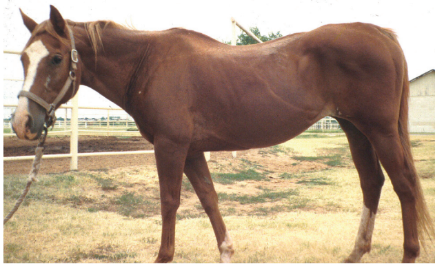
Picture 2. Horse in body condition score of 2. Note the evidence of individual vertebra along the back and croup area.

can be placed into a horse's stomach so a liquid diet can be administered if a horse is unable or unwilling to eat. Placing a nasogastric tube into a horse's stomach should be performed by a veterinarian as an improperly placed tube can result in death. An intravenous catheter can supply nutritional support if a horse's digestive tract cannot handle liquid or solid food. This type of nutrition is costly and is only used short term until the digestive tract will accept and utilize feed.