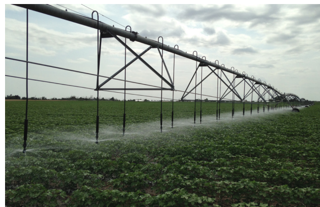
Figure 6. A low-pressure center pivot system in southwestern Oklahoma.

Drip and localized irrigation systems (the third major type of irrigation systems along with sprinkler and gravity) occupied only 11,492 acres of irrigated lands in 2018. This shows only a small increase compared to 2008, when 11,239 acres of irrigated land were under this type of irrigation system. More than half of drip-irrigated acres in 2018 were under sub-surface drip and about a third of them were under low-flow micro-sprinklers.