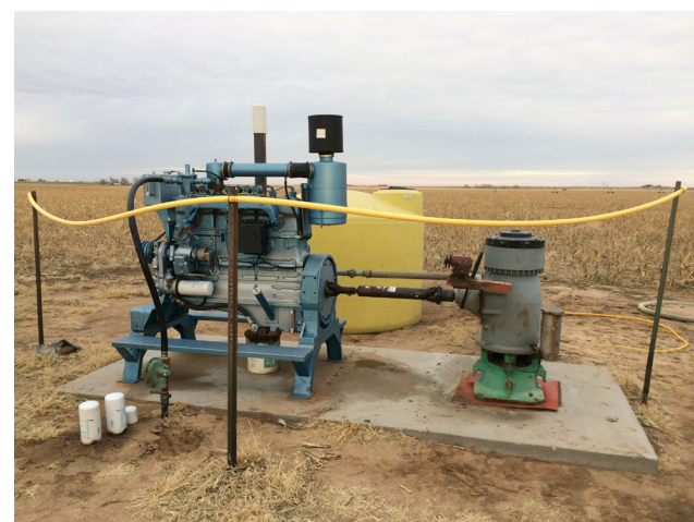
Figure 3. A natural gas engine extracts groundwater for irrigation.

Regardless of water source (surface or ground), many irrigated farms rely on pumps to either raise the water to a desired level or to pressurize it for distribution through sprinkler and drip systems. In 2018 Oklahoma producers spent about $21.5 million in energy expenses to power 6,530 pumps. Though producers powered more pumps in 2018 compared to 2013 and 2008, they expended 3% less compared to 2013 and 31% less than 2008. Taking irrigated acres into account, the amount of energy expenditure in 2018 translates into $42 and $18 per acre for groundwater and surface water irrigation, respectively. Electricity was the main source of pumping energy, supplying water to 46% of all irrigated acres in state. The second major energy source was natural gas, which contributed 39% in 2018. The third most-used energy source was diesel, which powered pumps to irrigate 15% of the remaining irrigated acres in 2018.