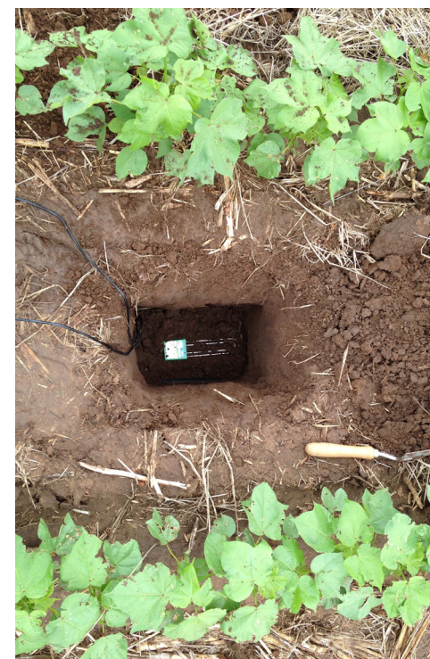
Figure 4. Installing soil moisture sensors at a cotton field near Altus.

Improving irrigation management is not possible without implementing state-of-the-art methods in deciding when to irrigate. In Oklahoma, the main method for determining irrigation timing was the "condition of crop" in 2018, mentioned by 84% of irrigated farms. The next most common method was the "feel of soil," used by 36% of all irrigators. The third most common method was based on "personal calendar," implemented in 10% of all farms. Smart methods such as soil moisture sensing devices, plant sensing devices and computer models had a low adoption rate, with each one of them being mentioned by less than 5% of irrigated farms. Among these smart methods, the use of soil moisture sensing devices in Oklahoma lags the national average and many neighboring states. The percentage of farms that used these sensors was 12% across the nation, 10% in Texas, 11% in Arkansas, and 19% in Kansas. Nebraska was the leading state, with about one-third of all irrigated farms having adopted the soil moisture sensing devices in their irrigation scheduling. Surprisingly, the use of soil moisture sensors in Oklahoma was two times larger back in 2013 at 11%, similar to the national average. It is not clear why the adoption rate has declined dramatically in the 2018 survey.