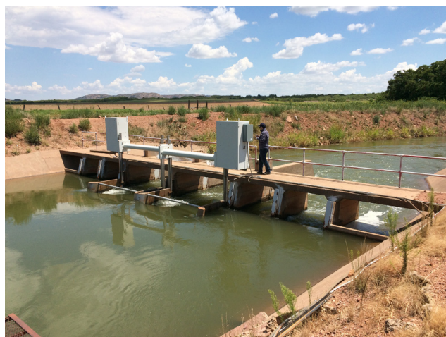
Figure 2. An irrigation canal taking water from Lake Altus in southwest Oklahoma to agricultural fields.

reliance on groundwater compared to 2013, when groundwater accounted for 92% of irrigation water applied in the open. The larger dependence on groundwater in 2013 was probably a result of the 2011-2014 drought, which severely limited surface water resources. The share of groundwater in supplying irrigation was about 83% in 2008, like 2018. However, the volume of groundwater withdrawn for irrigation in 2018 was 30% larger than 2008 and 17% larger than 2013. This increase in the total amount of groundwater extraction could shorten the life of those aquifers that have a limited recharge capacity, such as the Ogallala aquifer in Oklahoma Panhandle. It should be noted that the reported amount of applied water is based on irrigators' best estimate and not metered flow rates.