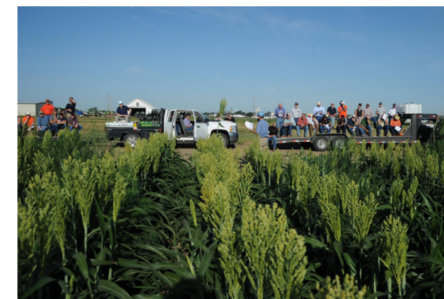
Figure 5. A field day at the Panhandle Research and Extension Center, where irrigation studies are being conducted on corn and sorghum.

Irrigation systems can be generally divided into three main categories of gravity (a.k.a. surface or flood), sprinkler