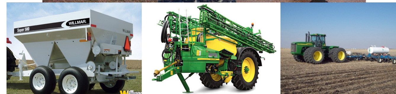
Figure 2. Equipment used for N-Rich Strips. From top-left to bottom right: Push spreader, ATV with 10-foot spray boom, receiver hitch mount with trigger in cab, dry fertilizer spreader, sprayer pull or self-propelled (often only use middle section) and anhydrous applicator.