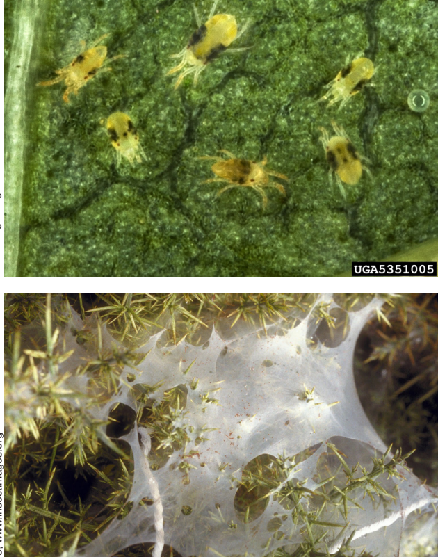
Figure 8. Adult two-spotted spider mites (top) and webbing produced by gorse spider mite (bottom).

dry conditions, it may take as little as seven days for mites to develop from egg to adult. At 70°F the life cycle is twenty days but only half that when temperatures are at 80°F. High temperatures and low relative humidity favor mite development. In two to five days, eggs hatch into six-legged larvae that feed for a short time. Larvae then develop into eight-legged nymphs that pass through two stages, the protonymph and deutonymph. Between each stage, larvae and nymphs enter an inactive resting stage that lasts a short time. The eight-legged adult finally emerges from the last resting stage. Because each female may deposit 100 eggs or more during her lifetime, there is a high potential for rapid population growth.