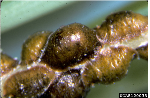
Figure 4. Black scale (upper left), hemispherical scale (upper right), and soft brown scale (lower left).

Arthropod Pest Management in Greenhouses and Interiorscapes