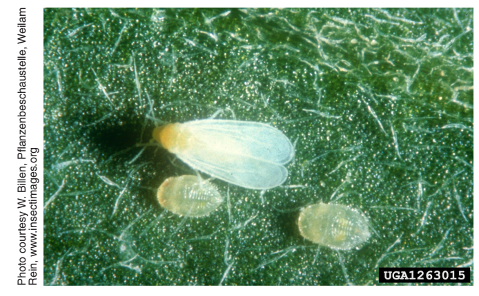
Figure 6. Adult and larvae of greenhouse whitefly.

Whiteflies are not true flies, but are close relatives of aphids and scales. They measure 1/16inch long, have four wings, and are orange underneath. They resemble small white moths due to the white, waxy powder on top of their bodies (Figure 6). Whiteflies reside on the underside of leaves and will fly readily when disturbed. During