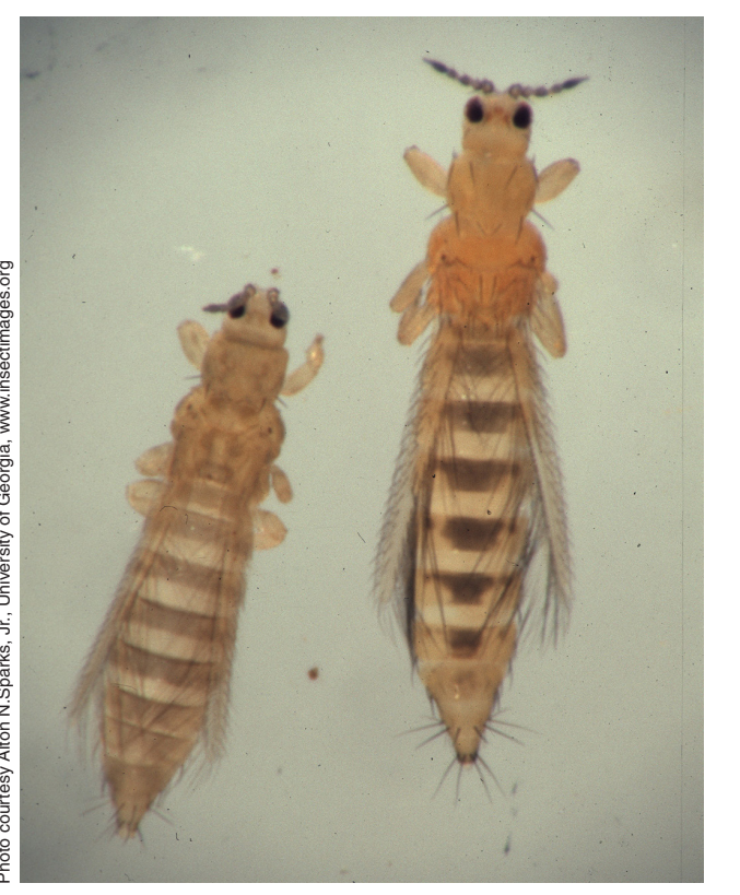
Figure 7. Onion thrips (left) and western flower thrips (right).

Most thrips species measure no more than 1/8 inch long, have slender bodies, and have two pairs of stalk-like wings fringed with long hairs (Figure 7). Populations often proliferate on weeds growing around greenhouses during summer months and may be carried in by air currents through open vents or doors (especially during wheat harvest in Oklahoma). Thrips attack a wide range of crops and can be found in buds, on flower petals, and in axils of leaves. While adults can be seen without a hand lens, they usually hide in buds or flowers. Thrips can be detected by thorough visual inspection of plants and by tapping foliage, buds,