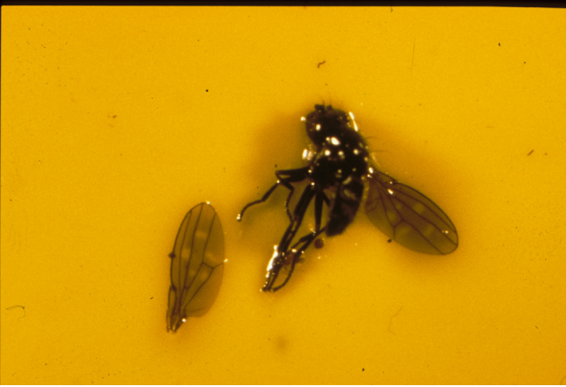
Figure 3. Shore fly adult caught on a yellow sticky card. Note clear spots on wings.

shore flies have larger, more robust bodies and relatively shorter legs and antennae. Eggs are laid in areas of algal growth and larvae hatch within four to six days following oviposition. There are three larval stages; mature larvae measure about 1/4 inch long and are opaque, yellowish brown, and lack a head capsule. The life cycle is complete in 15 to 20 days, depending on temperature. Larvae feed primarily on algae and are not known to feed on plants, but adults deposit feces on leaves, causing a reduction in aesthetic quality. Additionally, adult shore flies are known to transmit black root rot and water-mold fungus in their feces, especially under wet conditions.