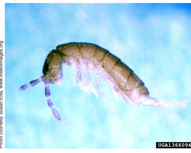
Figure 11. Springtail.

Springtails are very small, white, gray, black, brown, or purple insects that lack wings (Figure 11). A specialized structure beneath the tip of the abdomen enables them to jump an inch or more into the air. Springtails prefer dark, damp areas high in organic matter. They feed primarily on fungi, algae, and decaying organic matter in growing media. However, feeding may occur on tender roots of some crops. Damage may occur to seedlings, but springtails rarely cause enough harm to be considered major pests. When large populations occur, they are easily found on the soil surface or can be seen "springing" about during watering or moving a crop. Springtails may be spread in unpasteurized potting soil, transported on clothing, via plant contact, or simply migrating indoors from nearby habitats.