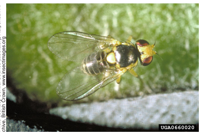
Figure 9. Adult chrysanthemum leaf miner.

Tunneling maggots feed just under the outer cell layer of leaves, causing unsightly runs or mines as they feed. Damage causes reduced aesthetic quality, but tunneling usually does not kill the plant. Problematic greenhouse species include the serpentine leaf miner, Liriomyza trifolii, and the chrysanthemum leaf miner, Phytomyza atricornis. Adult serpentine leaf miners have a black body with yellow markings, a yellow head, and brown eyes. As its name suggests, mines created by this species are serpentine in appearance. Adult chrysanthemum leaf miners are larger and grey to black with many hairs on their body. Their mines can appear blotchy as well as serpentine and tend to be found near the leaf mid-vein.