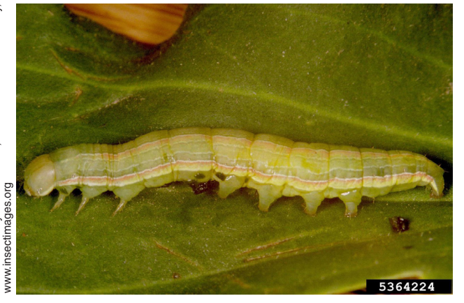
Figure 10. Beet armyworm caterpillar. Note the three pairs of true legs near the head and five pairs of fleshy, abdominal prolegs.

Feeding damage occurs on leaves when the caterpillar chews holes or "skeletonizes" leaf tissue (feeding only on tissue between veins). A severe infestation of caterpillars can quickly defoliate entire plants. Injury may not be noticed when caterpillars are young, but damage becomes increasingly evident as these pests develop and grow. Caterpillars are particularly troublesome during the summer months when moths are active outdoors. Most moths are nocturnal and attracted to lights, entering a greenhouse through open