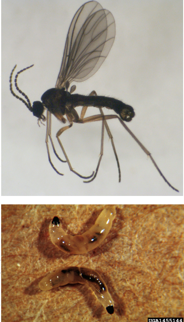
Figure 2. Darkwinged fungus gnat adult (top) and larvae (bottom).

Fungus gnats are delicate, dark gray to black flies with long legs and antennae (Figure 2). These insects reside on the soil surface and will fly about when pots are disturbed or watering occurs. Adults measure about 1/8 inch long and possess one pair of transparent wings. Females lay clusters of 20 to 30 eggs on moist soil surfaces, par-