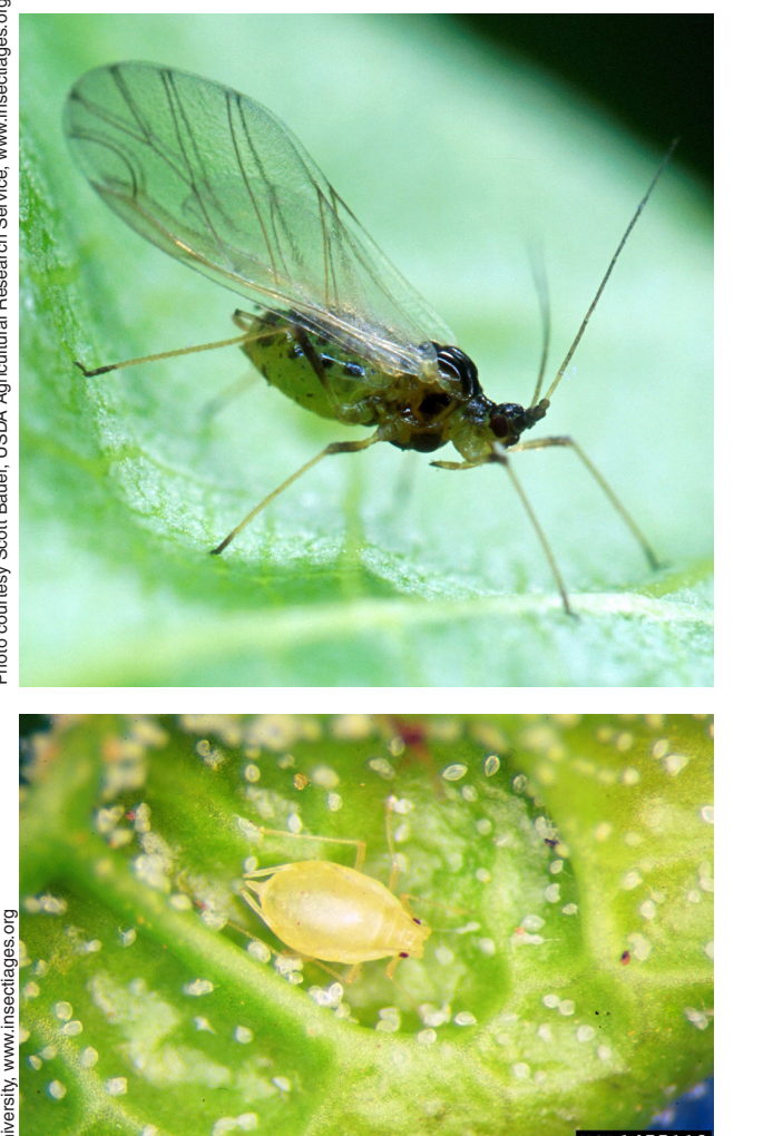
Figure 1. Green peach aphid adults, winged (top) and wingless (bottom).

face of the body and a dark spot can be seen on the abdomen. Using a hand lens, a distinguishing feature can be observed: a small indentation is present at the front and top of the head. Also, the antennae are long enough to reach the cornicles, and the base of each antenna bears an inwardly projecting bump (tubercle) that is only visible with a compound microscope. Green peach aphid feeds on more than 100 plant species, including a wide variety of vegetable and ornamental plants.