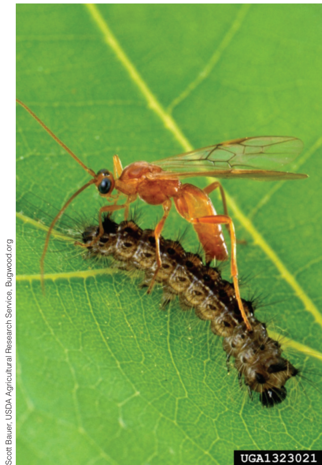
Scott Bauer, USDA Agricultural Research Service, Bugwood.org UGA1323021 Adult female parasitoid wasp attacking gypsy moth caterpillar.

Pupa: Silken cocoons found on or around the body of the host