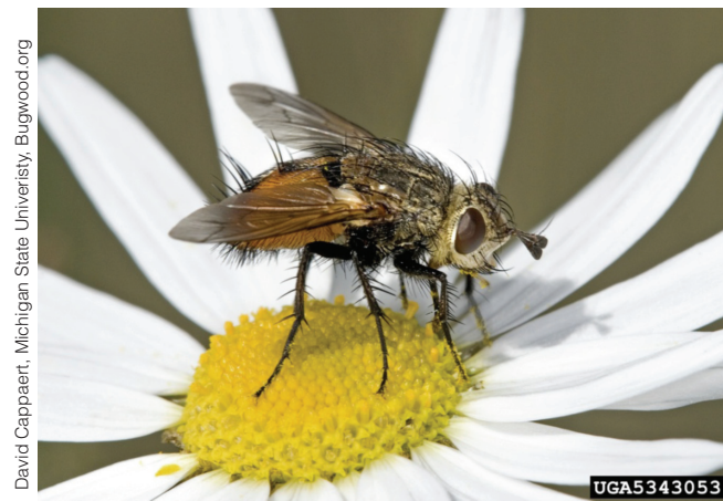
Adult of tachinid fly visiting daisy.

Hosts: Beetles, true bugs, moths, and butterflies