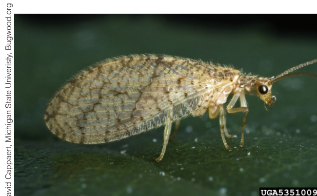
Adult brown lacewing. Note the large wings with many veins.

Adult: Brown with slender bodies and large, transparent wings with many veins