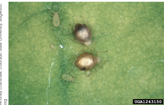
Whitney Cranshaw, Colorado State University, Bugwood.org UGA1243150 Aphid "mummies" are telltale signs of parasitism by parasitoid wasps. The swollen, dark-colored mummies are shown in comparison to unparasitized aphids.