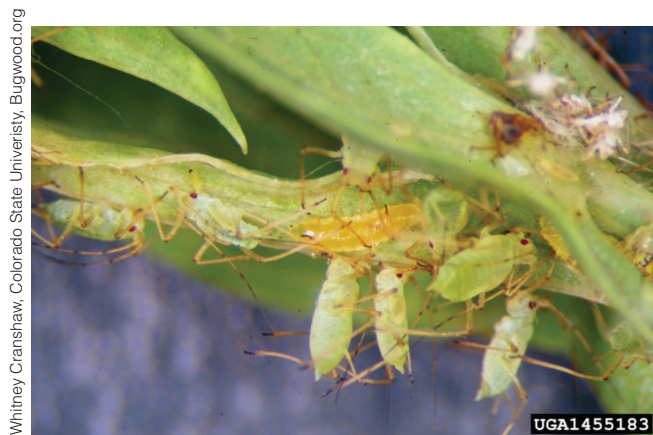
Predatory midge (orange) feeding on pea aphids.

Habitat and Feeding Preferences: Aphid midges need shelter from high temperatures and strong winds. Plants that create a canopy clustered together could create habitat that would attract aphid midges.