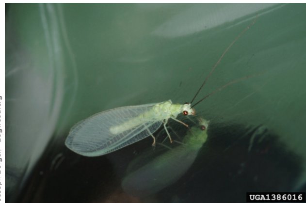
Adult green lacewing. Note the large wings with many veins.

General Description: Lacewings are also known as “aphid lions,” referring to the larva’s voracious appetite for aphids. Larvae also consume other small prey items such as insect eggs. However, adults feed solely on nectar and “honeydew,” a sugary waste product of