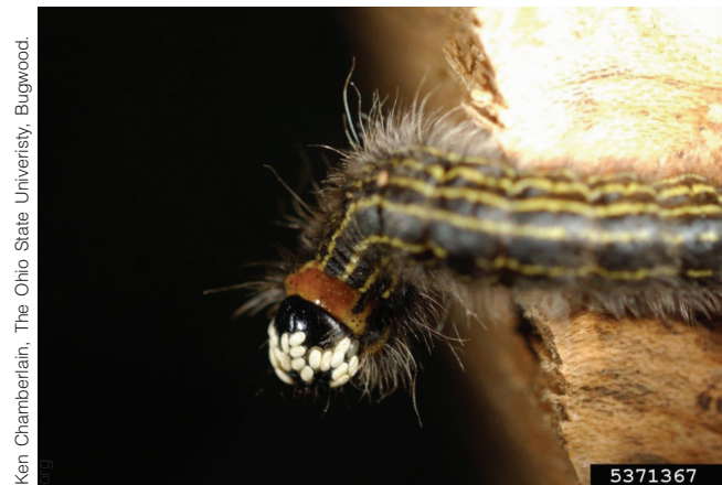
Eggs of tachinid fly laid on compound eyes of a yellow-necked caterpillar.

General Description: Several different species of tachinid flies are found in Oklahoma and attack a variety of pest insects at various life stages. Some are host specific, while others are able to parasitize several types of insects. All tachinid flies go through complete metamorphosis with egg, larva, pupa, and adult stages. Eggs are often laid on the host but sometimes are laid on the food source for the host to consume. Larvae almost always are internal parasites and feed inside the host until pupation when they bore out, killing the host, and pupate in the soil. Although adults are easily seen, the most common indicators of parasitoid activity are insects with several white, oval eggs present on their body or discovery of the leathery pupa.