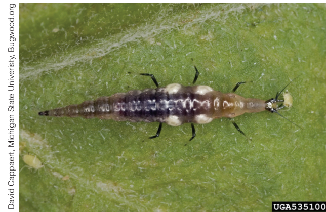
Larva of brown lacewing feeding on an aphid.

Prey: Whiteflies, aphids, and insect eggs