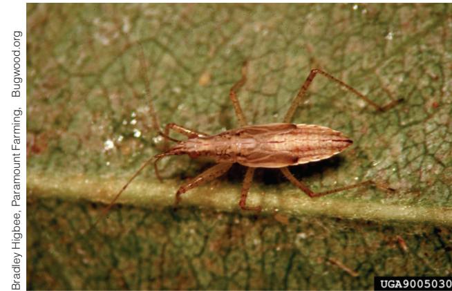
Bradley Higbee, Paramount Farming, Bugwood.org UGA9005030 Nymph of a damsel bug. Adults look similar, but have fully formed wings.

Adult: Grayish-brown with large, grasping front legs and a long "beak" (piercing-sucking mouthparts)