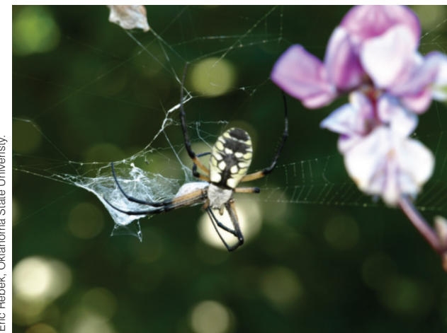
Garden spider in web.