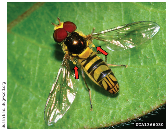
Adult hover flies resemble bees but have one pair of membranous wings with a second pair reduced into specialized structures called halteres (see arrows).

General Description: Immature hover flies are voracious aphid predators, eating up to 400