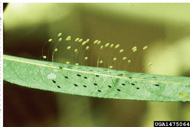
Green lacewing eggs on a willow leaf. Note that eggs are laid on silken stalks.