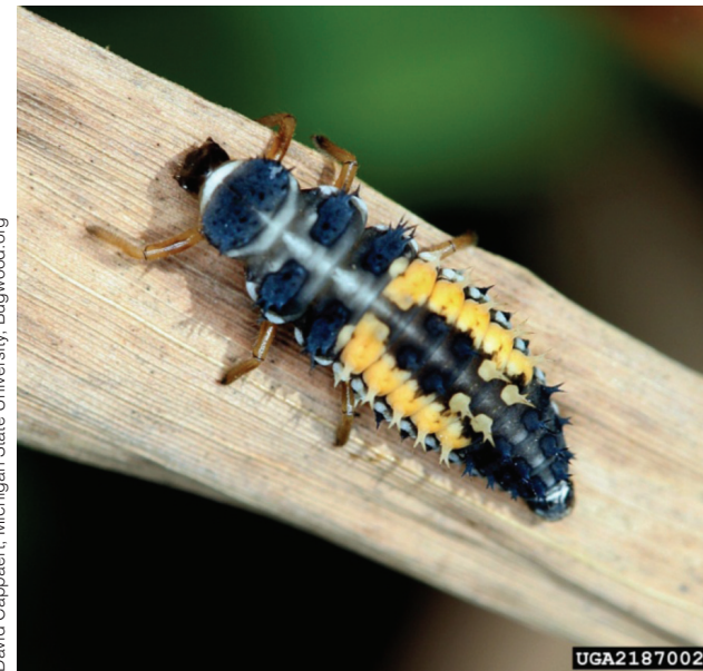
Larva of multi-colored Asian lady beetle.