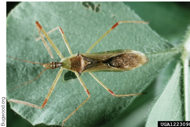
Adult of an assassin bug, Zelus exsanguis .

General Description: Assassin bugs vary greatly in their choice of prey. Some specialize on one particular type such as ants, while others are generalists, feeding on anything from small items such as aphids and insect eggs to larger prey such as lygus bugs, leafhoppers, and even lady beetles. Several species of assassin bugs are found in Oklahoma. Common species include Arilus cristatus (Wheel Bug), Zelus species, and Sinea diadema (Spined Assassin Bug). Assassin bugs undergo gradual metamorphosis. Nymphs resemble adults but lack fully developed wings. Different species vary widely in size and color. Assassin bugs can be as long as 1½ inches and range from brown or gray to bright orange with stripes. Key features are the large grasping front legs, narrow head, and the stout, three-segmented “beak” (most true bugs have a four-segmented “beak”). Eggs are brown and laid in masses on plants or in the soil.