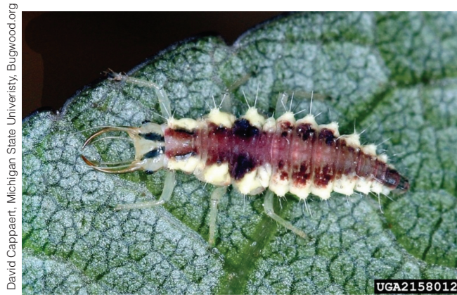
Larva of green lacewing.

aphids. Green lacewings undergo complete metamorphosis. Adults measure about 1/2-inch to 3/4-inch long with large wings.