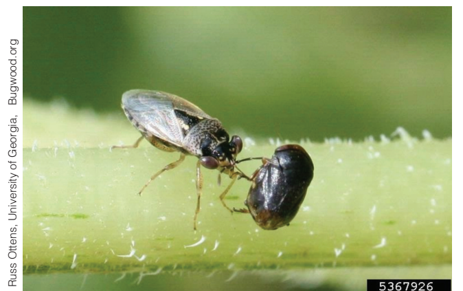
Adult big-eyed bug feeding on a spittlebug. Note the large, bulging eyes on sides of the head.

Big-eyed bug adults and immatures find shelter in mixed plantings and can feed on pollen, nectar, and even seeds when prey populations are low. Sunflowers are an excellent choice to help conserve these natural enemies.