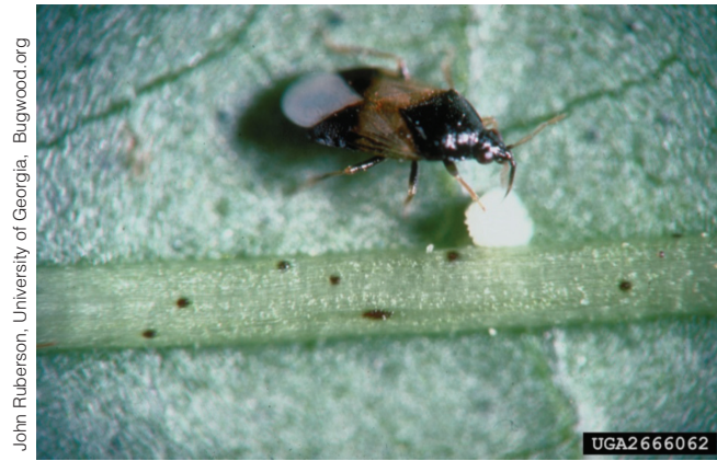
UGA2666062 Adult minute pirate bug feeding on unidentified insect egg.