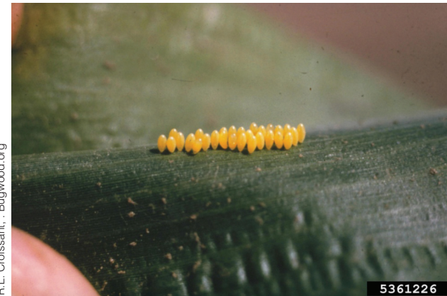
Lady beetle egg mass on corn leaf.