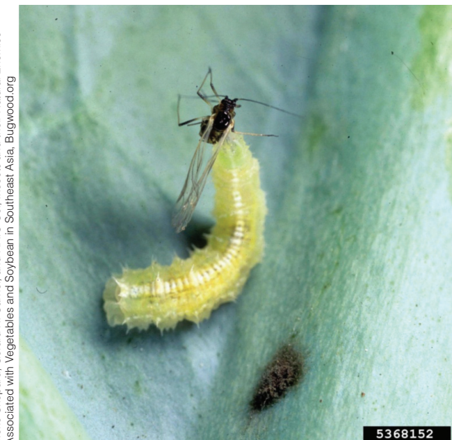
Larva of hover fly feeding on an aphid.

aphids during development, depending on the species. Adults are not predatory and feed only on pollen and nectar. Adult hover flies are efficient pollinators. There are many species of hover flies in Oklahoma. One common species is Allograpta obliqua (Oblique Syrphid). Hover flies undergo complete metamorphosis with three larval stages. Hover flies can be distinguished from bees and wasps by their lack of hind wings, which are reduced into small clubs called halteres. Hover fly adults are very adept fliers and often hover over flowers, hence their name.