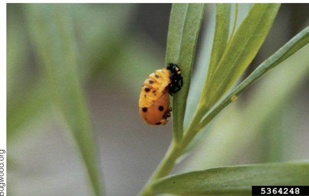
Pupa of multi-colored Asian lady beetle.