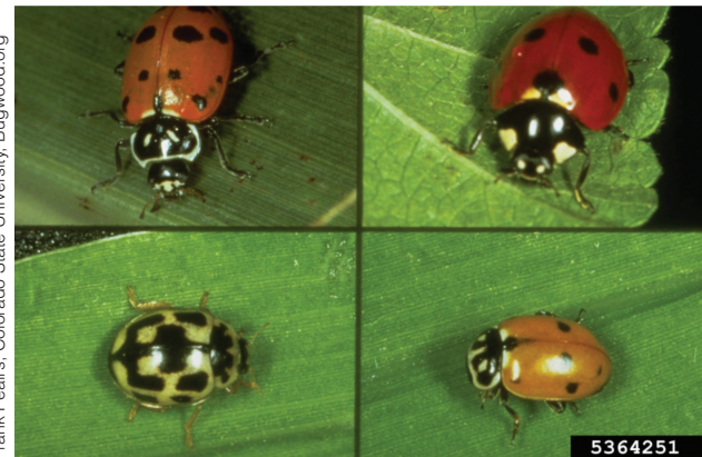
Adults of four species of lady beetle. Clockwise from upper left: convergent lady beetle, seven spotted lady beetle, variegated lady beetle, and fourteen spotted lady beetle.

Prey: Aphids, scales, and other small, soft-bodied insects, mites, and insect eggs