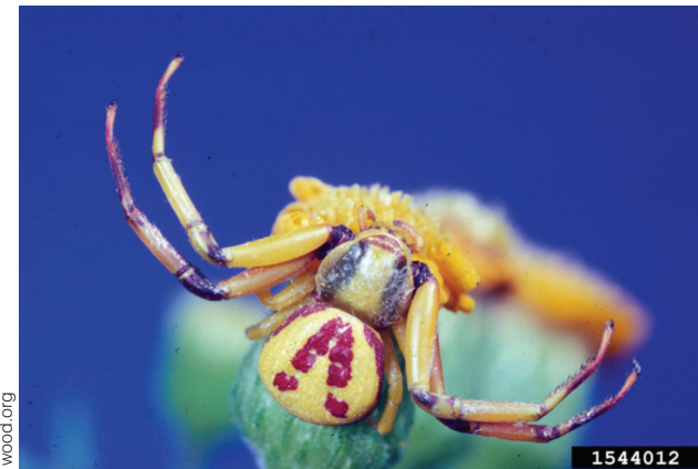
Crab spider on flower bud

General Description: Spiders are not insects, but are related arthropods belonging to the class Arachnida. They are generalist predators and will attack insects and other arthropods smaller than themselves. Many types are web