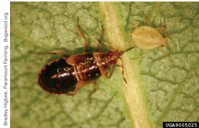
Bradley Higbee, Paramount Farming, Bugwood.org UGA9005025 Nymph of minute pirate bug feeding on aphid.

additional mortality by piercing prey without feeding on them. Minute pirate bugs undergo gradual metamorphosis. Once eggs hatch, nymphs develop through five stages before becoming adults. Adults measure 1/8-inch long or less and the lower half of the outer pair of wings are membranous.