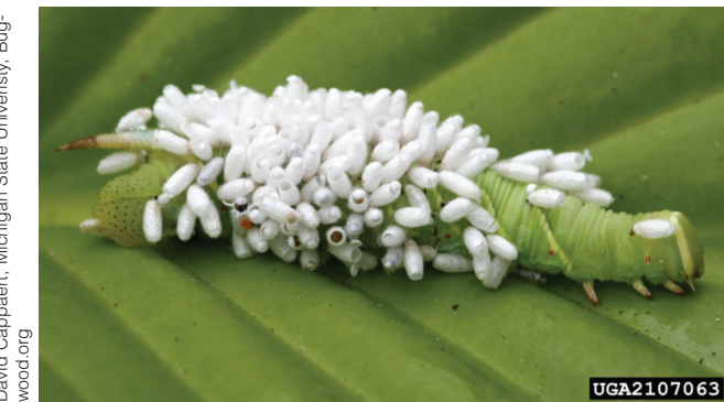
Silken cocoons of parasitoid wasps on a hornworm larva. Note that some cocoons have holes at the top where adult wasps emerged.