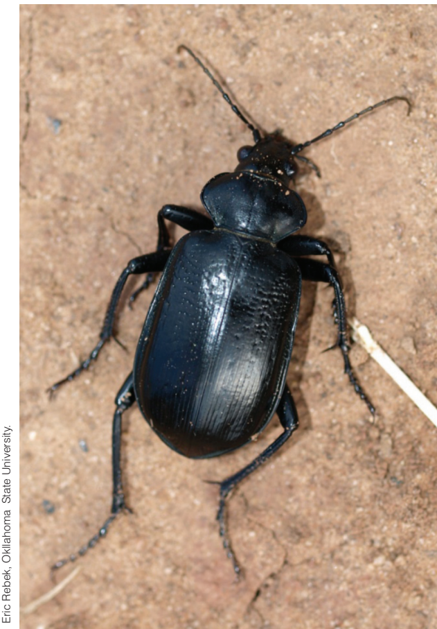
One of many species of ground beetles. Both adults and larvae are predators, but larvae are rarely encountered.

Adult: Typically brown or black, sometimes metallic blue or green with a clearly distinct head, thorax, and abdomen; with prominent eyes