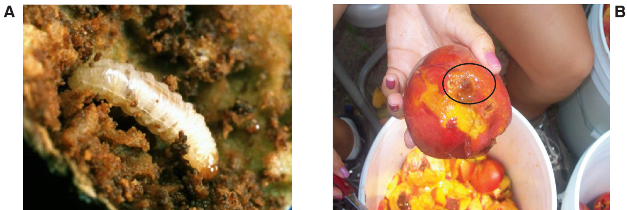
Figure 3. Larval stage of the plum curculio showing A) close up of the small larva and large amounts of frass (insect excrement) and B) The larva (encircled) adjacent to bruised area and frass accumulation.

In March, when temperatures reach or exceed 70° F for two days, growers should begin to accumulate degree days within their orchards. A degree-day-based model helps growers time scouting and/or trapping of plum curculio. The model uses a base temperature for weevil development of 50° F. Treatment is justified between 100 and 400 degree days (generally April) if the threshold (0.045 weevils/trap/day) is reached and/or 1 percent of new plum curculio damaged peach fuzz or crescent-shaped feeding wounds are found on peaches. After 1,000 degree days (early June and later), treat if trap captures exceed the same threshold, and repeat spraying at 10-day intervals if trap catch and/or new damage dictates.