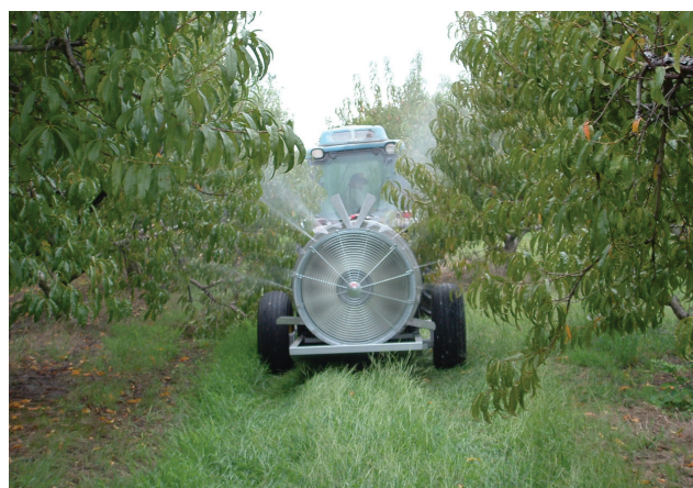
Figure 4. Airblast sprayer in peach orchard.

Once a threshold has been obtained in an orchard, treatment should be conducted using an airblast sprayer calibrated to deliver a minimum of 40 to 50 gallons per acre (Figure 4). For maximum benefit, many growers will calibrate their sprayers to spray 100 gallons per acre. Airblast sprayers come in a number of sizes. Some larger sprayers can reach the tops of trees in excess of 80 feet and provide excellent coverage to the entire canopy. This may be overkill for fruit trees which do not typically grow to that height. Regardless of insecticide selected, multiple applications will likely be needed throughout the weevil season, especially if fruit are marketed for retail sales. Commercial growers should be encouraged to treat at least two sides of each tree when making pesticide applications; this ensures penetration and thorough coverage. For a complete listing of pesticide recommendations on peaches, including information on fungicides to protect trees from disease infection, consult OSU Current Report CR-6240. This publication is revised each year and contains detailed, current information on chemical recommendations for peaches and nectarines.