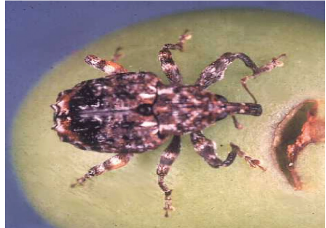
Figure 1. Plum curculio adult next to crescent-shaped oviposition scar on peach.

A complete life cycle, from egg to adult, takes about 50 to 55 days; however, temperature and moisture conditions play a major role in regulating plum curculio development and activity. Weevil adults need water before much activity takes place. In addition, weevils are more active on warm, damp, cloudy days and in thick, heavy stands of trees that provide abundant moisture in the center of the orchard. Curculio activity