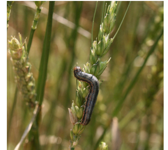
Figure 2. Armyworm caterpillar.

Damage: Small larvae skeletonize the surface of leaf blades and the inner surface of the leaves. As they grow, they will consume entire leaves, and feed on the beards of emerged wheat heads (Figure 3). The most obvious direct damage to the wheat head is "head clipping," when caterpillars chew completely through the stem and the head falls off the plant (Figure 4). While head clipping is a problem in barley, it is