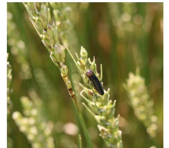
Figure 3. Armyworm damage to head.

Damage: Small larvae skeletonize the surface of leaf blades and the inner surface of the leaves. As they grow, they will consume entire leaves, and feed on the beards of emerged wheat heads (Figure 3). The most obvious direct damage to the wheat head is "head clipping," when caterpillars chew completely through the stem and the head falls off the plant (Figure 4). While head clipping is a problem in barley, it is