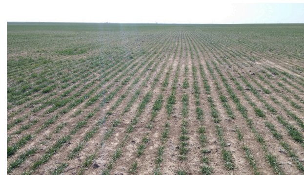
Figure 8. Army cutworm damage to a wheat field.

or plant growth to be delayed because they are only partially attached to their roots. Infested fields often seem to "slowly disappear" as army cutworms feed and grow (Figure 8).