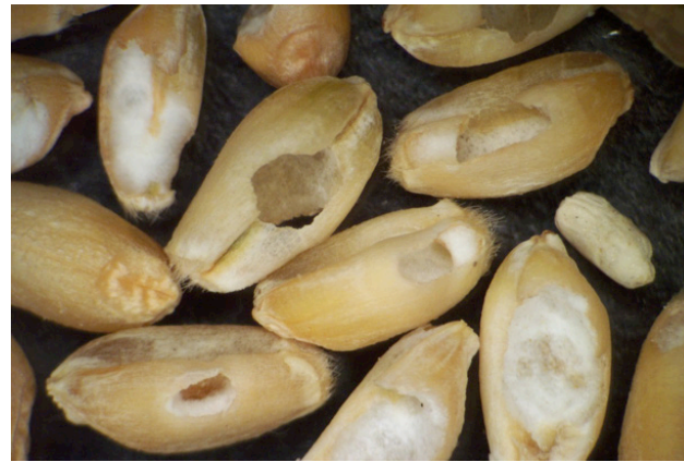
Figure 14. Wheat head armyworm damage to grain.

Damage: Wheat head armyworms feed on developing wheat kernels, causing direct damage to the seed (Figure 14). The major issue with wheat head armyworm damage has to