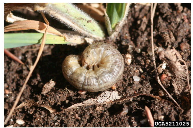
Figure 7. Army Cutworm larva.