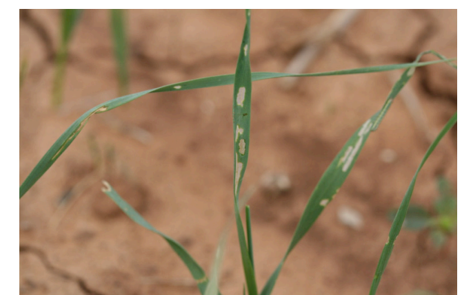
Figure 11. Fall armyworm damage windowpaning.