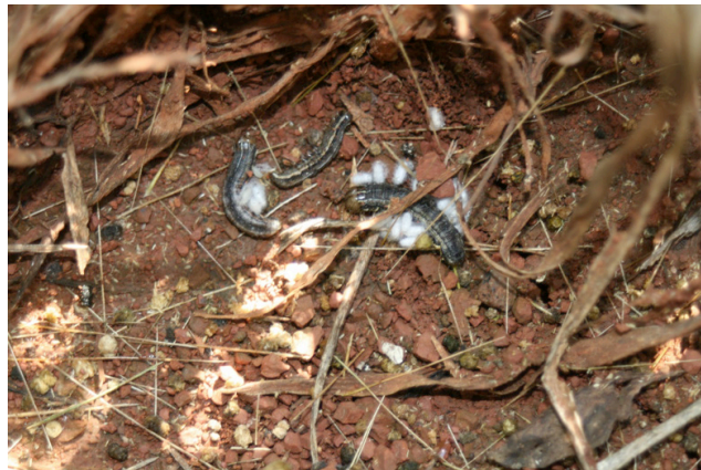
Figure 5. Armyworms parasitized by Glyptapanteles militaris .

Description and Life History: Army cutworm is an erratic pest of small grains in Oklahoma, but can cause widespread