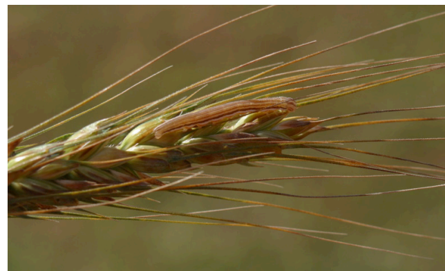
Figure 13. Wheat head armyworm caterpillar.

do with the grain grading, which is classified as IDK (Insect Damaged Kernels). Grain elevators will dock wheat when samples contain 6 to 31 damaged kernels per 100 grams of seed. To coincide with the Food and Drug Administration's defect action levels (the U.S. Standards for Wheat), consider wheat containing 32 or more insect-damaged kernels per 100 grams as U.S. Sample Grade. This grain is unfit for human consumption and can only be sold as animal feed. It is important to note that although the wheat is damaged, it is not an indication of an on-going infestation of grain weevil or some other stored grain insect pest.