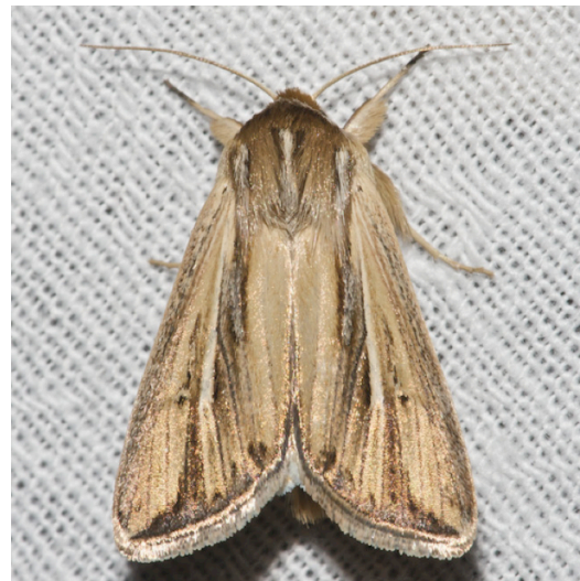
Figure 12. Wheat head armyworm adult.