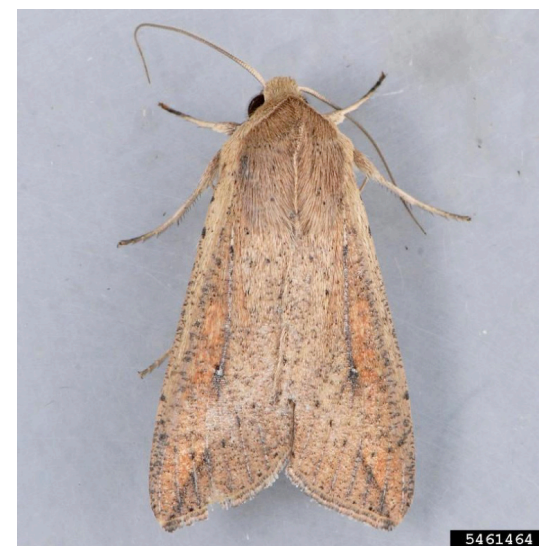
Figure 1. Adult Armyworm.

Oklahoma usually experiences several generations of armyworms in a given year, but only one is normally of concern for winter wheat production. The last fall generation of armyworms overwinters as partially grown caterpillars in grass pastures or on grassy weed hosts, and pupate in the soil in late winter. Adult moths emerge in early spring (late March and April) and lay eggs in wheat fields.