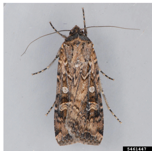
Figure 6. Army cutworm moth.

Damage: Army cutworms get their name because they feed at the base of plants, separating the top of the plant from its roots at the crown base. They can cause direct stand loss