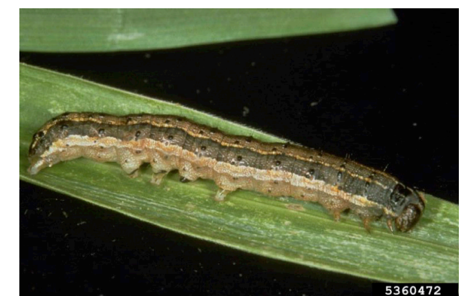
Figure 10. Fall armyworm caterpillar.

In seedling wheat, the treatment threshold is two to three larvae per linear foot of row. As plants get older, the treatment threshold is three to four larvae per foot of row, if accompanied with evidence of obvious foliage loss.