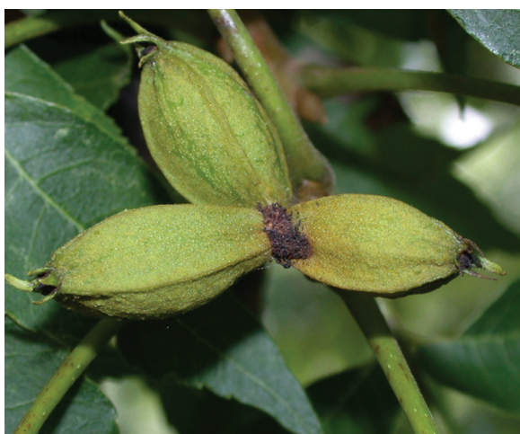
Figure 6. Insect excrement (frass) indicating larval entry into nuts.

case (hibernaculum) near a bud or leaf scar for overwintering. These larvae emerge from hibernacula in the spring and feed by tunneling into shoots. Pupation of the overwintering generation occurs in these tunnels formed from feeding, and adults emerge the following spring to deposit the first generation of eggs on pecan nuts.