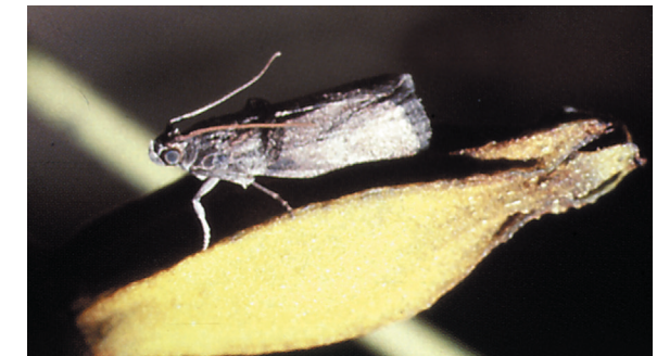
Figure 1. Adult pecan nut casebearer.

The pecan nut casebearer, Acrobasis nuxvorella Neunzig, is one of the most devastating nut-feeding insects that occur in pecans. The pecan nut casebearer (PNC) is found throughout pecan growing regions from Florida to southern New Mexico. In Oklahoma, adult casebearer moths deposit eggs during late May or early June. Eggs are deposited on the tips of nuts shortly after tree pollination. After hatching, the larvae burrow into nuts. Each larva may damage an entire cluster. The primary means of controlling this insect is the use of a well-timed application of insecticide based on infestation levels from each individual orchard.