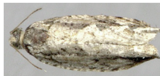
Figure 7. Pecan bud moth ( Gretchena bolliana )

males generally occurs 12 to 16 days before the optimum time for application of insecticides. Do not be tempted to apply an insecticide during peak moth capture, since this will usually occur a week or more before a properly timed treatment. In addition, a heavy moth flight may not necessarily translate into a successful and/or heavy oviposition (egg-laying) cycle. In Oklahoma, during the period that mating and subsequent oviposition occurs, moths are exposed to many environmental influences that can effect survival and successful propagation. Strong winds and storms may occur and result in high levels of mortality of adult moths. In addition, many predators and parasites feed on casebearer eggs. These will be discussed in a subsequent section of this publication.