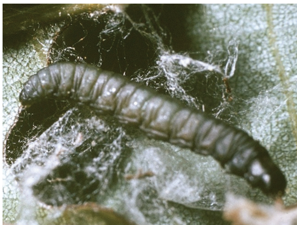
Figure 5. Mature pecan nut casebearer larva.