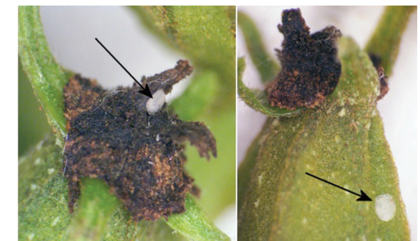
Figure 2. Pecan nut casebearer eggs.

Adult casebearer moths (Figure 1) are gray to dark gray, have a dark ridge of scales on the forewings, and are about \frac{1}{3} inch in length. Mating and egg deposition occurs during the night, and female casebearers can deposit 50 to 150 eggs during their five to eight day life span. Eggs are small and oval shaped (0.36 X 0.65 mm). The first generation of eggs are laid singly at or near the calyx lobes of nuts after pollination (Figure 2). PNC eggs are white when first laid, then gradually change to a red color three to five days before hatching (Figure 3). When larvae hatch they are white to yellow in color (Figure 4) and feed initially on buds. Full grown larvae are olive gray to jade green and reach about \frac{1}{2} inch in length (Figure 5). As the larvae grow and move to developing nuts, they will bore into the base of one or more nuts. Black excrement (frass) and silk at the base of nuts indicates larval entry (Figure 6). They remain within the nut and feed for four to five weeks. Full-grown larvae will pupate inside the pecan and emerge as moths 9 to 14 days later.