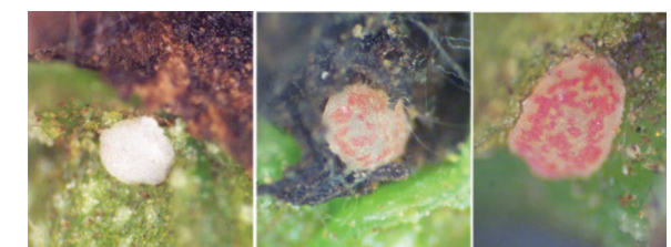
Figure 3. Egg color change.

Second-generation PNC begin appearing in mid-July. Larvae feed primarily on pecan shucks. Unless populations are extremely high, little damage is created from second-generation larvae. Third-generation PNC hatch 30 to 40 days later and feed for a short time (if they feed at all) on shucks. Late in the season, each small larva forms a tightly woven, protective silken