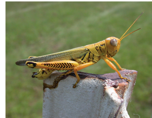
Figure 3. Differential grasshopper.

bloom, causing heavy losses of the seed crop along the field margins. Similarly, if grasshopper populations remain high into the fall, seedling stands of recently-planted alfalfa can be devastated. Although many chemical options are available for grasshopper control in alfalfa, the greatest impact can be realized by targeting populations in areas adjacent to alfalfa fields before grasshoppers reach maturity in June. Regardless of the age of an alfalfa stand, this management approach will help in avoiding applications targeted at adult grasshoppers, which are difficult to control. In the case of fields used for seed production, early management in border areas will prevent serious losses of seed and preserve beneficial organisms and pollinators.