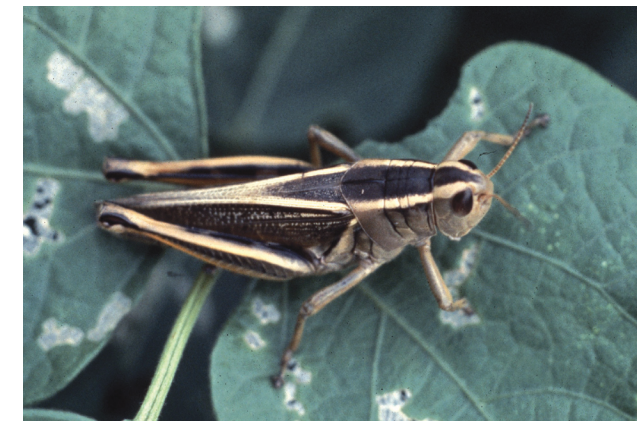
Figure 2. Two-striped grasshopper. (Cranshaw, Whitney. Colorado State University. Image 1326160. www.insectimages.org. April 16, 2004)

Although grasshoppers may defoliate alfalfa in areas adjacent to field borders, they pose a more serious threat in fields used for seed production. In these areas, grasshoppers will preferably feed on fruiting structures when the crop is in