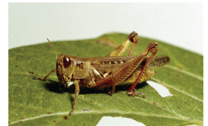
Figure 4. Redlegged grasshopper.