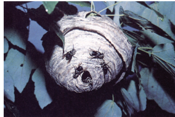
Figure 3. Baldfaced hornet, Dolichovespula maculata (Hymenoptera: Vespidae), and nest.