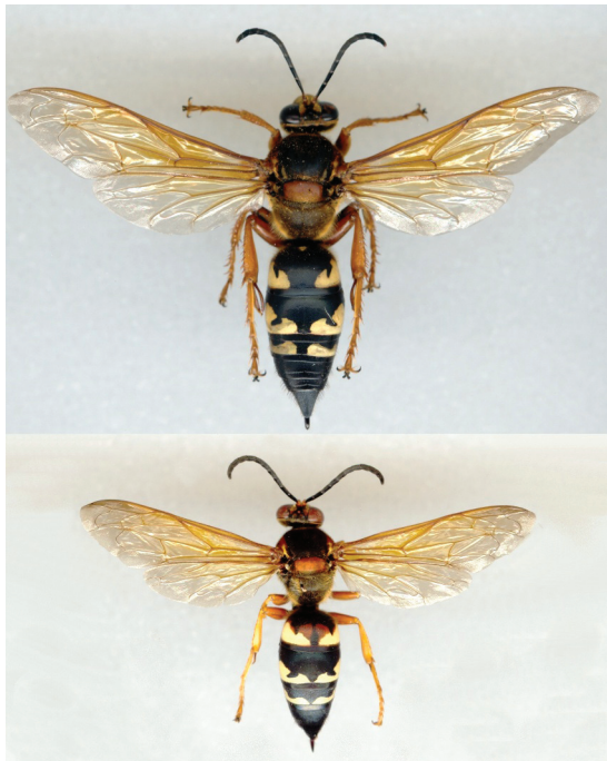
Figure 6. Male (left) and female (right) cicada killer Sphecius speciosus , (Hymenoptera: Vespidae).