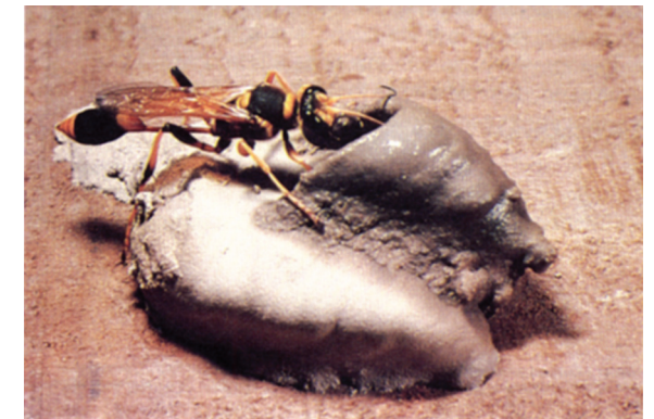
Figure 5. Mud-dauber, Sceliphron caementarium (Hymenoptera: Sphecidae), on nest.

Mud-daubers commonly build their mud nest (Figure 5) in attics, porches, and carports and stockpile them with spiders. These slender wasps are about the size of the paper wasps, but are conspicuously different due to their thread-like "waist"