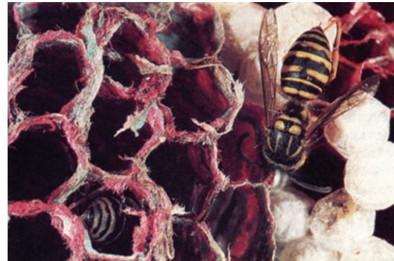
Figure 2. Southern yellowjacket, Vespula squamosa (Hymenoptera: Vespidae), on nest.

The nesting biology of yellowjackets is similar to that described for paper wasps, but with a few exceptions of relevance to their stinging hazard. The colony usually survives longer