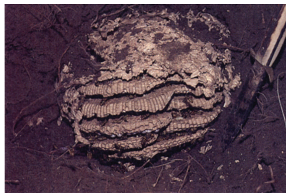
Figure 4. Exposed underground nest of eastern yellowjacket, Vespula maculifrons (Hymenoptera: Vespidae).