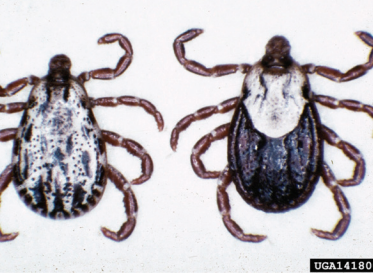
American Dog Ticks