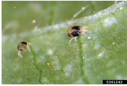
Two-spotted Spider Mite