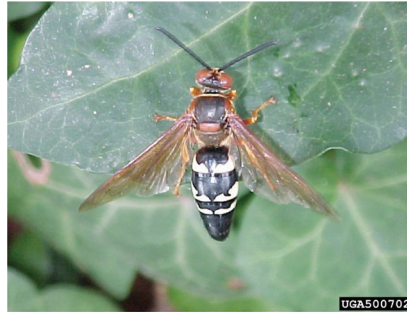
Cicada Killer Wasp