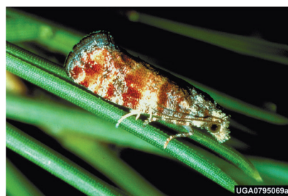
Pine Tip Moth (adult)