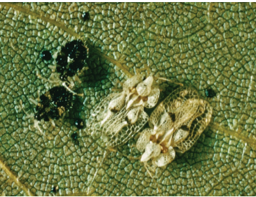
Sycamore Lace Bugs