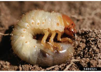
May-June Beetle Larva