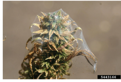
Two-spotted Spider Mite Webbing