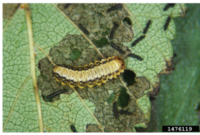
Elm Leaf Beetle (larvae)