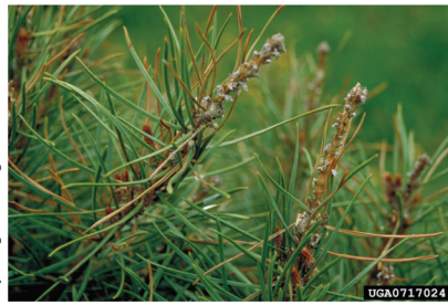
Pine Tip Moth Damage