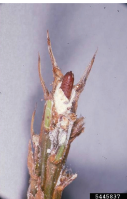
Pine Tip Moth (larvae)