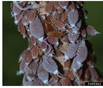
Woolly Maple Aphids