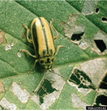
Elm Leaf Beetle