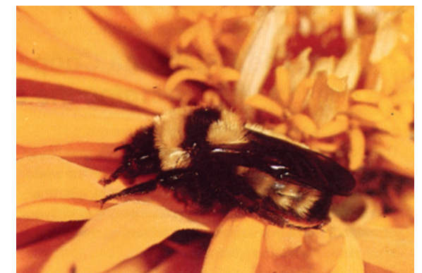
Figure 5. Bumble Bee.