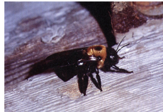
Figure 4. Carpenter Bee.