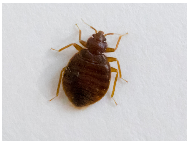
Figure 1. Adult bed bug.