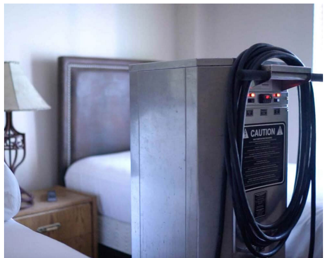
Figure 4. Heat treatment in bedroom.