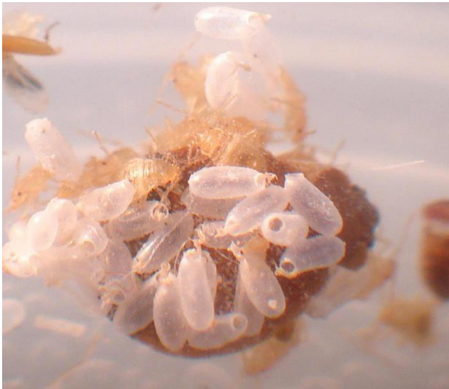
Figure 6. Bed bug eggs.