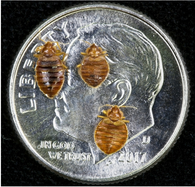
Figure 5. Bed bug image on dime.