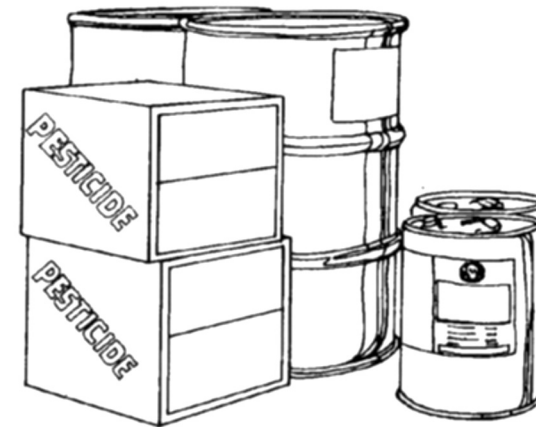
Figure 3. Store Pesticides with Label Plainly Visible.

All pesticide containers should be checked often for corrosion, leaks, and loose caps or bungs. These dangerous conditions must be corrected immediately. You may be able to position or rotate a can or drum that has been punctured to put the hole on top to stop the content from escaping, or