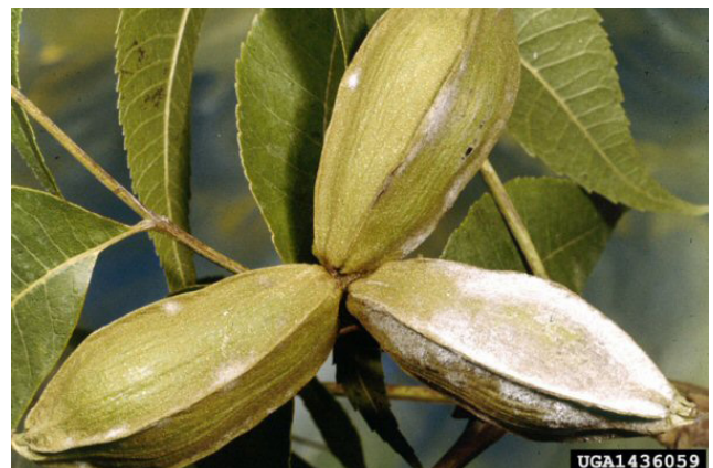
Figure 4. Nuts of a pecan tree infected by powdery mildew fungus.