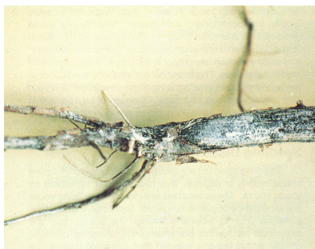
Figure 4. Charcoal rot.

Since this disease is associated with stressed plants, incidence of charcoal rot can be reduced through proper fertilization, weed control, and irrigation. Crop rotation with poor hosts of the fungus, such as cotton or small grains, for one to two years, can help in minimizing yield loss due to charcoal rot. There are no known resistant varieties; however, varieties that do not bloom and set pods during the normally dry months of July and August are more likely to escape infection by charcoal rot. There are no known chemical controls.