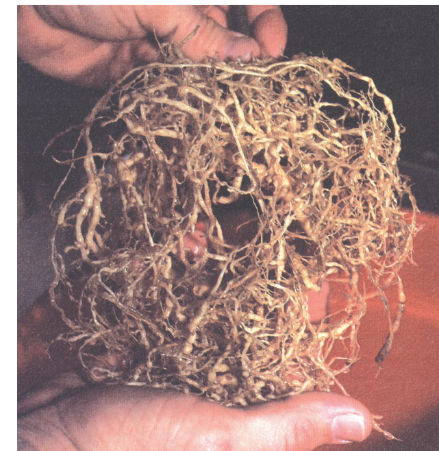
Figure 6. Galls on roots caused by the root-knot nematode.