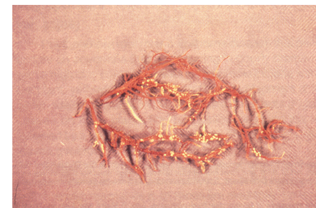
Figure 8. Soybean cyst nematodes produce small white to pale yellow cysts that contain eggs.