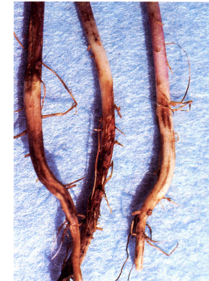
Figure 1. Seedling disease.

Seedling diseases can be reduced by delaying planting until soil temperatures increase above 68 F and by planting high quality seed. A fungicide seed treatment can reduce seedling diseases and improve stand, especially in early planted soybeans. Seed treatments are relatively inexpensive and in most cases ensure a good stand. However, seed treatments will not make up for poor quality seed with less than 85 percent germination. Consult the most recent Soybean Production Guide (Extension Circular E-854) or the OSU