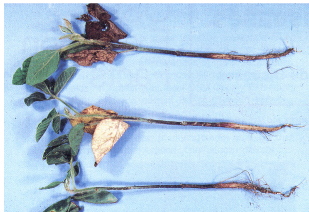
Figure 2. Phytophthora root rot.