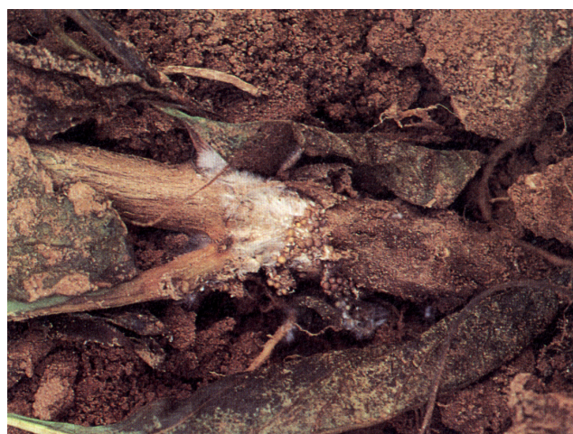
Figure 3. Southern stem blight.

Charcoal rot is a common soilborne fungal disease of soybeans in Oklahoma. Yield losses due to charcoal rot are difficult to measure because the disease is closely associated with drought stress and nutrient deficiencies. High plant