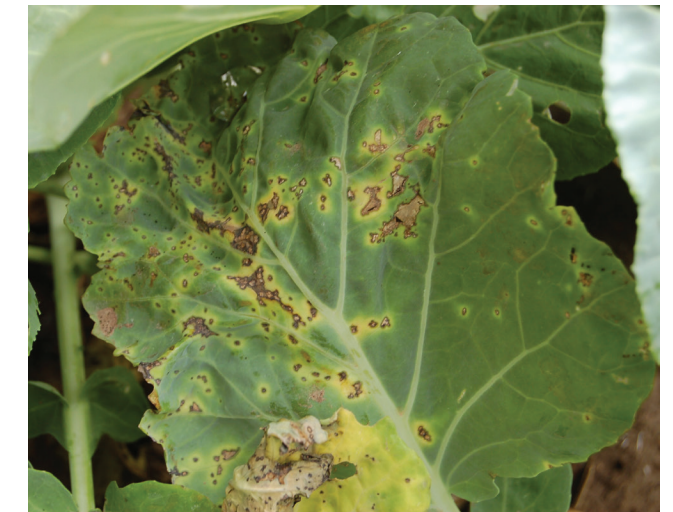
Figure 2. Kale leaf with Xanthomonas leaf spot.

leaves. Older leaves with lesions may develop numerous black, oval spots on the petioles and soon drop from the plant. Cutting into stems and petioles of severely affected plants reveals a black discoloration of the vascular system.