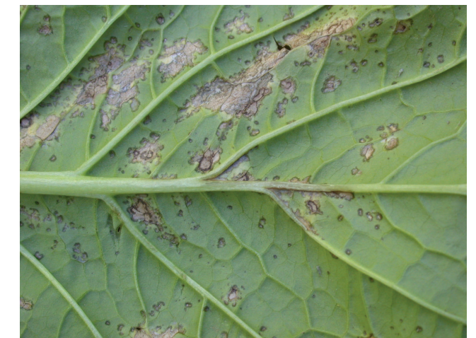
Figure 4. Underside of turnip leaf with bacterial leaf spot.