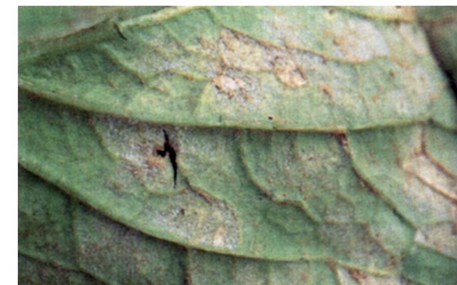
Figure 9. White mildew on lower side of turnip leaf caused by downy mildew.

Control - Cultural practices help prevent foliar diseases from becoming established in a crop. Incorporate crop residue soon after harvest to hasten its decomposition and reduce pathogen survival. Practice crop rotation with non-crucifer