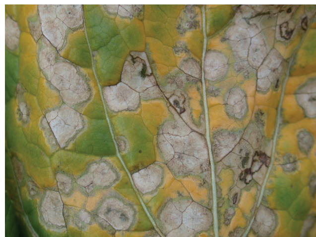
Figure 6. White spot on turnip leaf producing circular spots with dark borders and leaf yellowing.

Leaf spot diseases caused by these two fungi are similar in their symptoms, biology, and damage. Cercospora has been more frequent in recent years, but both are probably present. White spot is most severe on turnip, mustard, and turnip x mustard hybrids. The disease is less important on collards and kale. The fungi persist on infested crop residue and possibly wild crucifer weeds. Spores from debris, weeds, or neighboring fields become airborne and are blown to new fields. The disease has been most severe in the fall production season,