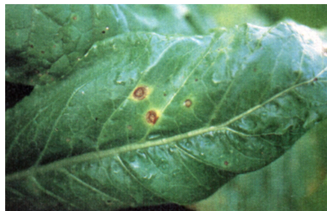
Figure 7. Black spot on turnip leaf.

Anthracnose occurs in Oklahoma, but is less common than white spot. The disease is most severe on turnip, but can