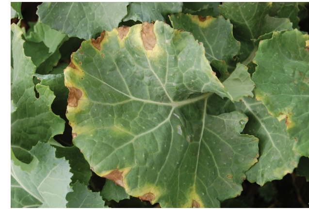
Figure 1. Kale with V-shaped lesions at the leaf margin caused by black rot.

in spite of these preventive practices. A fungicide spray program is the only effective method of control. Fungicides should be applied according to label directions and repeated if conditions favorable for infection persist. If possible, anticipate disease problems and begin a spray schedule before economic damage occurs. Consult the Extension Agents Handbook of Insect, Disease and Weed Control (Extension Circular E-832) for more information on fungicides currently registered for disease control on leafy greens.