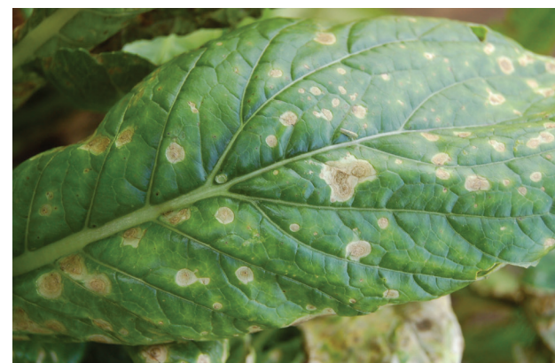
Figure 8. Anthracnose on turnip x mustard leaf.

Symptoms - Leaf spots are small, dry, circular, and pale gray to straw colored (Figure 8). Darker colored areas within the older spots are reproductive structures of the fungus. Severely infected leaves are killed. Spots on petioles are elongated, sunken, grey to brown, and have a dark black border.