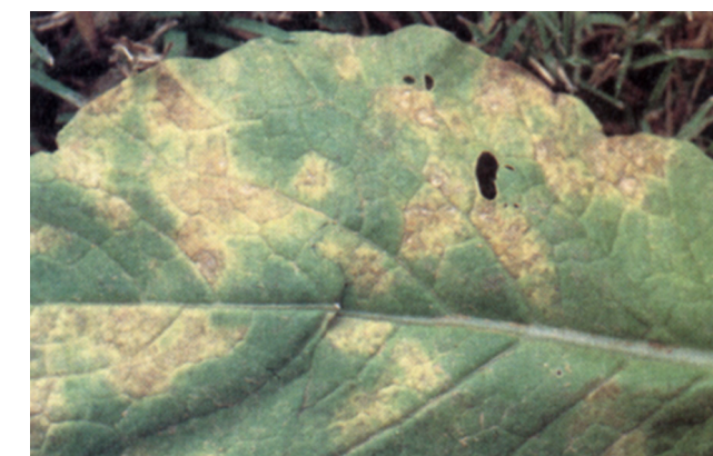
Figure 10. Yellow leaf spots on upper side of turnip leaf caused by downy mildew.