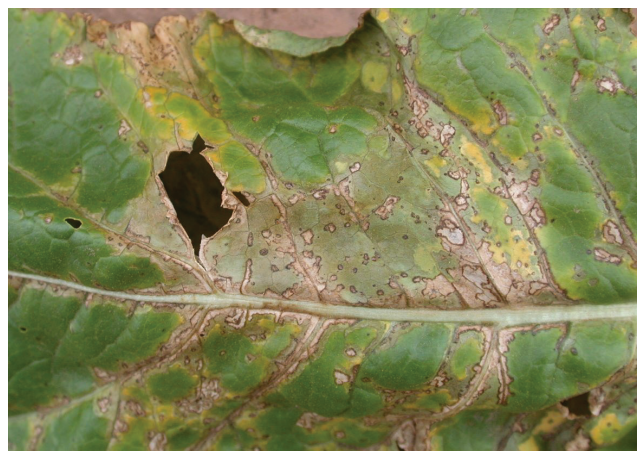
Figure 5. Upper side of turnip leaf with bacterial leaf spot.

Control - Control of bacterial diseases is effective only when the pathogen(s) are excluded from fields. Once bacterial pathogens are present in a field, control will be impossible under conditions favorable for infection. Purchase seed that has been tested and certified to be free of black-rot bacteria or hot-water treat seed as previously described. Because the bacterium that causes Xanthomonas leaf spot is closely related to the one that causes black rot, seed testing procedures for black rot also will detect this bacterium. However, seed testing procedures for bacterial leaf spot have not been developed. Plant seed in fields that have not been planted to crucifer crops for at least two years so that residue from previous crops is completely decomposed. Manage old crop residue to hasten its decomposition because the bacteria survive best on the soil surface and are poor soil competitors. Control of wild crucifers that may harbor bacteria in and around fields may reduce disease. Fields should not be worked while plants are wet because the bacteria are efficiently spread by mechanical means. While crucifers grown for production of leafy greens are usually direct seeded; nearby gardens, transplanted fields, and diseased fields also can serve as sources of the bacterium.