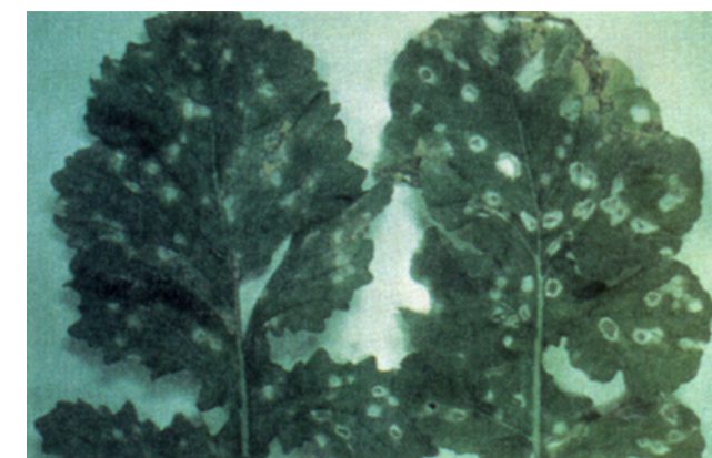
Figure 11. White rust on mustard leaves.