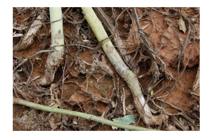
Figure 5. Stems of a susceptible variety girdled and constricted by black leg causing the plants to lodge.

After leaf spots appear, there is a latent (symptomless) period when the fungus grows internally from the leaf through the leaf petiole into the stem base where a canker develops. Because stem disease is slow to develop, an early appearance of leaf spot in the fall increases the likelihood that basal stem cankers will become severe and cause yield loss. Stem lesions partially or completely girdle the stem base, restricting the flows of water and nutrients necessary for complete pod fill and may result in lodging or premature maturity. As with many diseases in other crops, blackleg is generally only an issue every few years, when weather conditions favor the causal fungus' spore production and dispersal.