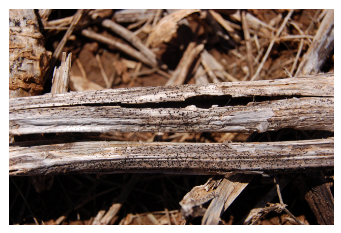
Figure 6. Fruiting bodies on canola stubble that produce the airborne spores that cause leaf spot.

Resistant varieties: Resistant varieties are the main defense against black leg and those varieties should be planted. There are two types of resistance in canola, multi-gene resistance and major gene resistance. Multi-gene resistance, also known as field resistance or adult plant resistance, is expressed as reduced canker severity in the spring. The specific genes involved are largely unknown and breeders typically screen breeding lines and varieties under heavy black leg pressure to identify field resistance. It is not unusual to observe blackleg symptoms in fields planted with multi-gene resistant varieties because they are susceptible to leaf spot and the resistance is only partially effective. Some degree of yield loss may occur with very favorable conditions for black leg development. The advantage of planting varieties with