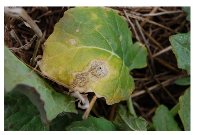
Figure 3. Older leaf spots are tan in color and contain distinct black fruiting bodies.

The fruiting bodies that develop within leaf spots produce clonal, or asexual spores called conidia. Conidia are produced in a sticky matrix and are not airborne, but rather move only short distances by rain splash to adjacent leaves and plants.