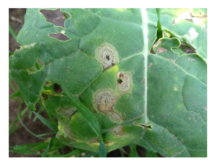
Figure 2. Close-up of grey-colored leaf spots with black pepper-like fruiting bodies of the fungus.

delayed, resulting in late (spring) appearance of leaf spots. Ascospore release generally coincides with canola planting in the fall and most spores are released from September through April. The spores may travel long distances on wind currents, but most land within 1,500 feet from their point of release. Weather conditions following planting also influence if and when leaf spots appear. Ascospores are released soon after a rain and extended periods of leaf wetness and warm temperatures (70 F) are required for leaf infection.