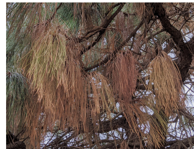
Figure 1. Early symptoms of pine wilt are visible as wilted, gray-green or brown needles which remain attached to the tree.

In most cases, trees that develop pine wilt are more than 10 years old. Typically, symptoms appear in July and may develop through December. The needles on a few branches will initially fade to green-gray and wilt (Figure 1). Needles