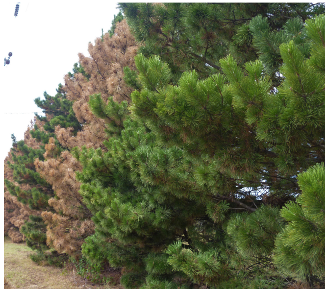
Figure 3. Trees with pine wilt may be found adjacent to unaffected pine trees.