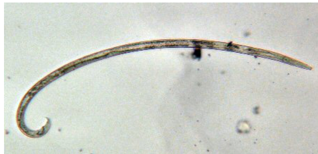
Figure 5. A microscopic pinewood nematode has been extracted from diseased pine wood. The pinewood nematode, Bursaphelenchus xylophilus , has distinct characteristics that allow it to be distinguished from free-living nematodes.

Pinewood nematodes can then survive by feeding on blue-stain fungi after the trees have died.