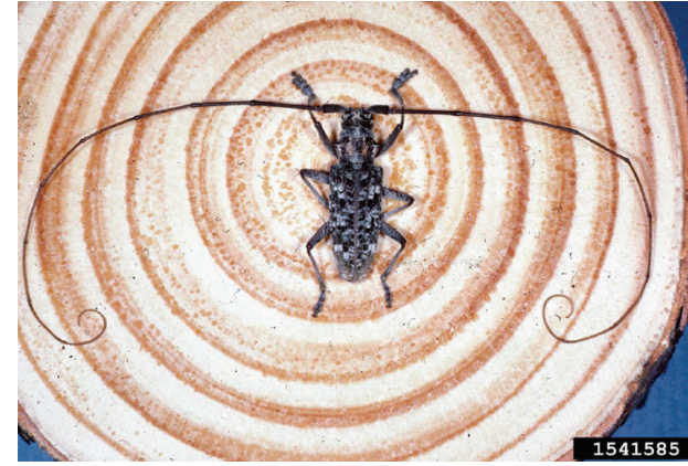
Figure 6. Southern pine sawyer, Monochamus titillator (male).

The life cycle of pine sawyer beetles is usually completed in roughly 50 days to 60 days. There is an average of 2 ½