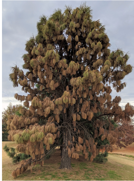
Figure 2. This entire pine tree has recently wilted and the needles are gray-brown due to pine wilt disease.