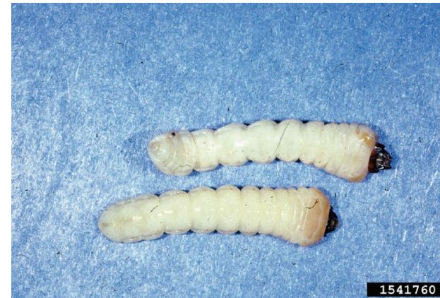
Figure 7. Larvae of southern pine sawyer.

generations per year in Missouri (details for Oklahoma are lacking). The female beetle chews a small hole in the bark of recently dead, dying or declining pine trees and lays her eggs. Young larvae feed on the inner bark, cambium and outer sapwood, forming shallow excavations (surface galleries). Older larvae bore into the heartwood and then tunnel back toward the surface, forming characteristic U-shaped tunnels (Figure 8). At the last stage of larval development, they form a pupal cell at the outer end of the tunnel near the surface of the wood. After pupation, the adult emerges by chewing a hole through the remaining wood and bark.