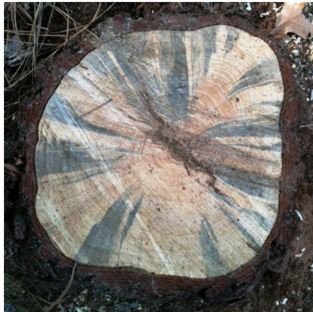
Figure 4. This pine stump shows blue staining that is common in dead and dying pine trees.