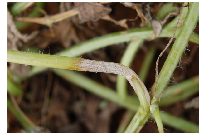
Figure 10. Gummy stem blight on leaf petiole with fruiting bodies.

margins, which is unusual for most foliar diseases. Heavily spotted leaves are killed and affected foliage does not remain erect like downy mildew. Fruiting bodies of the fungus may be visible on affected petioles as tiny black specks (Figure 10).