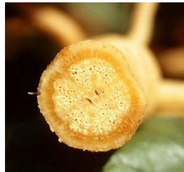
Figure 15. Light-brown discoloration of outer crown area (phloem) in lower stem is an internal symptom of yellow vine.

and wilting symptoms historically called 'Anasa wilt'. It was originally thought that yellow vine was caused by a toxin injected by the squash bug, however no toxin has ever been identified. The bacterium Serratia marcescens has recently been implicated as a plant pathogen vectored by the squash bug. However, only a small percentage of plants inoculated with S. marcescens develop yellow vine symptoms.