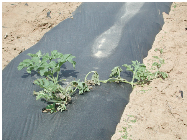
Figure 7. Fusarium wilt.

Symptoms: Plants may be affected early in crop development but symptoms most commonly develop later, begin-