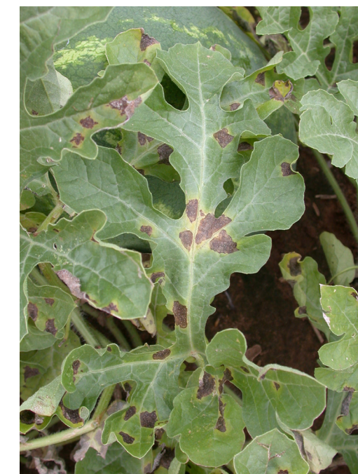
Figure 5. Downy mildew.

Symptoms: Symptoms of downy mildew are confined to leaves. The oldest leaves are usually attacked first. Symptoms first appear as pale green to yellow blotches on leaves that develop into spots that are circular to irregular in shape and dark brown to black in color (Figure 5). Affected leaves curl