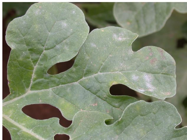
Figure 11. Powdery mildew.

for powdery mildew development. Numerous spores are produced by the fungus, resulting in rapid disease increase once the disease becomes established. The fungus grows and survives only on living cucurbit plants.