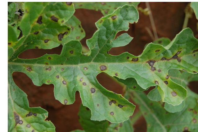
Figure 4. Cercospora leaf spot.

Disease biology: The fungus overwinters on crop debris, where it produces airborne spores that initiate disease development. Infection is favored by warm temperatures (80 to 90 F) and extended periods of leaf wetness. Older leaf spots serve as a source of spores for new infections.