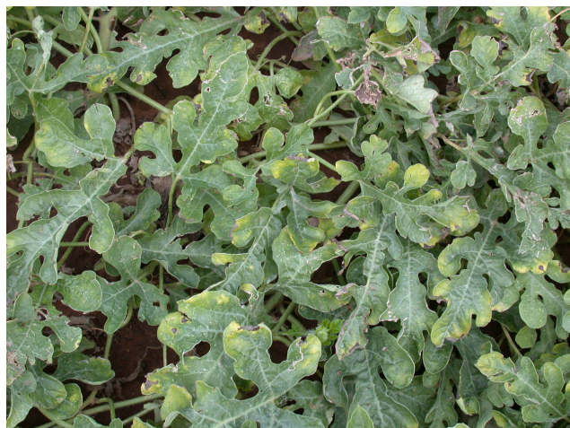
Figure 17. Early foliar symptoms of Verticillium wilt.

Symptoms: The disease generally appears after vines have set fruit. Symptoms first appear as yellowed wedge-shaped areas (Figure 17) on older leaves, which eventually