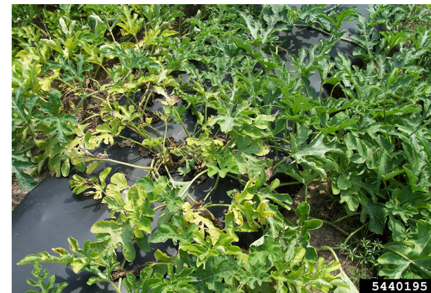
Figure 14. Yellow vine.

Disease Biology: Squash bugs overwinter as adults in brushy field perimeters and lay groups of shiny bronze-colored eggs on the undersides of leaves. Emerging nymphs and adults feed on basal stems and cause a range of yellowing