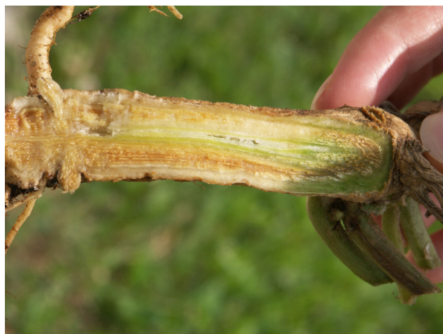
Figure 8. Brown discoloration of inner crown area (xylem) in lower stem caused by Fusarium wilt.

Disease Biology: Fusarium species cause root rots and vascular wilts of many crops. They are persistent soilborne fungi that increase in soils repeatedly cropped to susceptible crops. The strain that attacks watermelon is different from those that attack cantaloupe or cucumber. The fungus produces resistant spores that can survive in the soil for many years. The presence of nearby roots stimulates spore