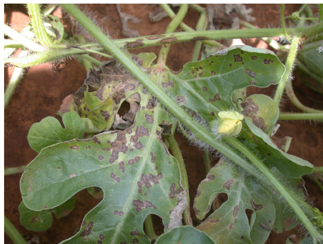
Figure 1. Anthracnose leaf spots and stem lesions.

Disease biology: Anthracnose is favored by extended periods of warm and rainy weather. The anthracnose fungus overwinters on infected debris from previous crops, on volunteers from seed of diseased melons left in the field, and may be seedborne in commercial seed. Spores produced on the debris and volunteers are spread to plants by splashing rain, sprinkler irrigation or surface runoff. Thereafter, disease