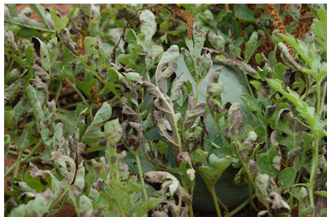
Figure 6. Inward curling of leaves with downy mildew.

inward, quickly die and remain attached to upright petioles (Figure 6). Severely infected foliage appears scorched. Petioles and stems remain intact for some time following defoliation. This is in contrast to anthracnose, which affects and kills stems and petioles as well as leaves.