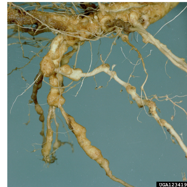
Figure 16. Root-knot nematode.

Symptoms: Aboveground, plants affected by root-knot nematode appear yellowed, stunted or generally unthrifty. Affected areas often occur as patchy areas in a field or along a row of plants. Uprooting affected plants is required to accurately determine that it is root-knot and not one of a number of other causes of poor plant development. Affected roots are