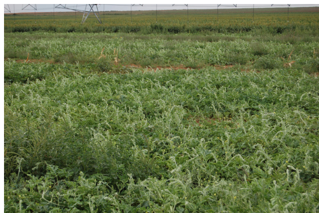
Figure 13. Upright vine growth from severe mosaic virus.