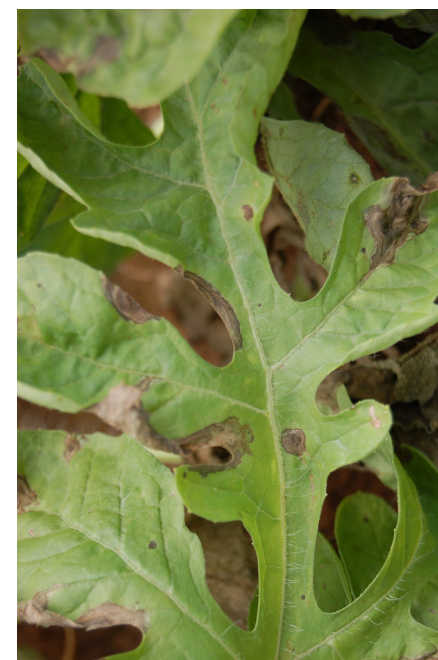
Figure 9. Gummy stem blight on leaf.

Symptoms: Gummy stem blight refers to the stem phase of this disease, which is more common on cantaloupes. On watermelon, the disease is mainly confined to the foliage (leaves and petioles), although seedling blight and fruit rot occasionally occur. Leaf spots are circular to irregular in shape, large (up to ¾ inch in diameter) and dark brown to black in color (Figure 9). The spots often develop at the leaf