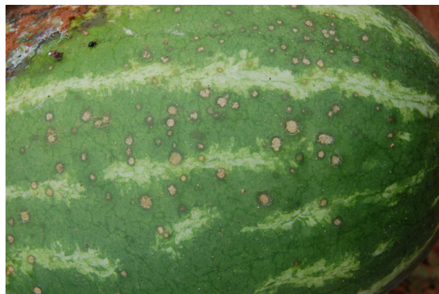
Figure 2. Anthracnose fruit spots.

increase is a result of infection by spores produced on new lesions, which are spread in the same manner.