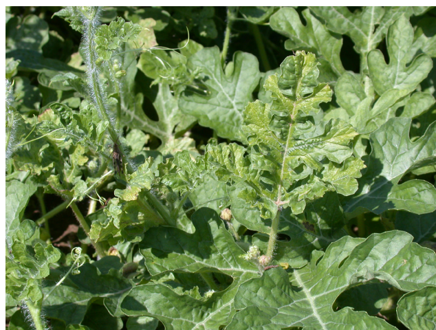
Figure 12. Mosaic virus.

Management: Control of viral diseases of watermelon is difficult because there are no virus-resistant varieties. Planting early to avoid late-season aphid build-up can be an effective way to escape virus disease. Aphid control with insecticides is not effective because insecticides do not kill aphids before they infect plants. Reflective plastic mulches that repel aphids are partially effective. Weed management should be practiced in and around cucurbit fields because weeds may harbor aphids and/or cucurbit viruses. Watermelon plantings, particularly those planted late in the season, should not be situated near or downwind of other fields or areas with virus symptoms. Planting alternating strips of grain sorghum or another short-statured summer grass with watermelons may be effective in reducing virus disease by acting as a 'virus sieve'. Aphids intercepted by the grassy boarder may lose infectivity as they taste or 'probe' the grass crop.