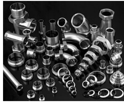
Figure 2. Bevel seat fittings