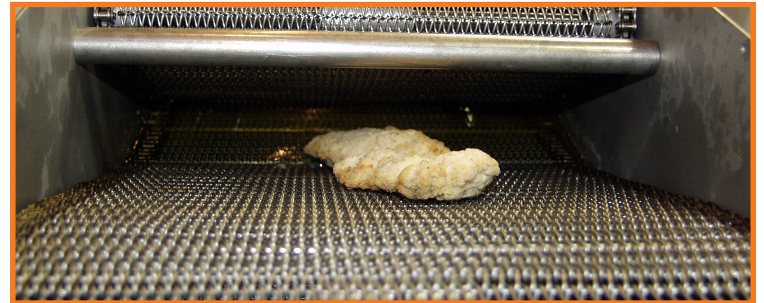
Photo 2. Chicken before the frying process.

Operations outside fryer design capacity alter the temperature profile in the fryer and may lead to excessive heat load, which trigger premature equipment break-downs and unacceptable product flavor and quality. The fryer operations below the design capacity also may have adverse effects on frying oil and final product quality such as low oil turnover, increased oxidative stress and reduced finished product shelf life.