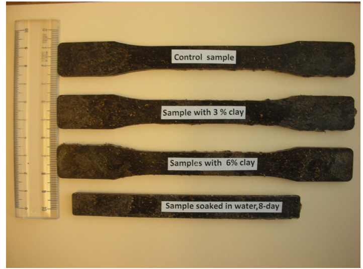
Figure 2. Wood-plastic test samples.