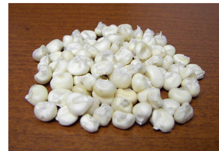
Figure 2. Miami white corn kernels.

It is best to have a thorough understanding of the traits your landrace exhibits and to preserve the ears that resemble the original traits (easily found on GRIN). The best traits to keep an eye on are kernel color, kernel type, number of rows around an ear, ear length, texture of endosperm and days to silk/ripening. Common traits that can be a sign of cross-pollination from other varieties are change in kernel type (i.e. flour to dent), increase in rows of kernels, color changes (plant and kernel) and plant dimensions. Traits from cross-pollination normally don't present themselves until the following year (except kernel endosperm and embryo), so keep in mind most selection at harvest is eliminating the previous year's cross-pollination. Actively selecting for the desired traits will minimize the flow of unwanted genes into your seed bank population. In addition to separating your harvest into ears exhibiting wanted and unwanted traits, it is natural to select healthy-looking ears that have performed well in your field/garden for your seed stocks.