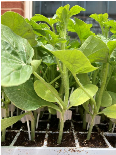
Figure 5. Grafted watermelons completely healed and ready for transplanting to the field.