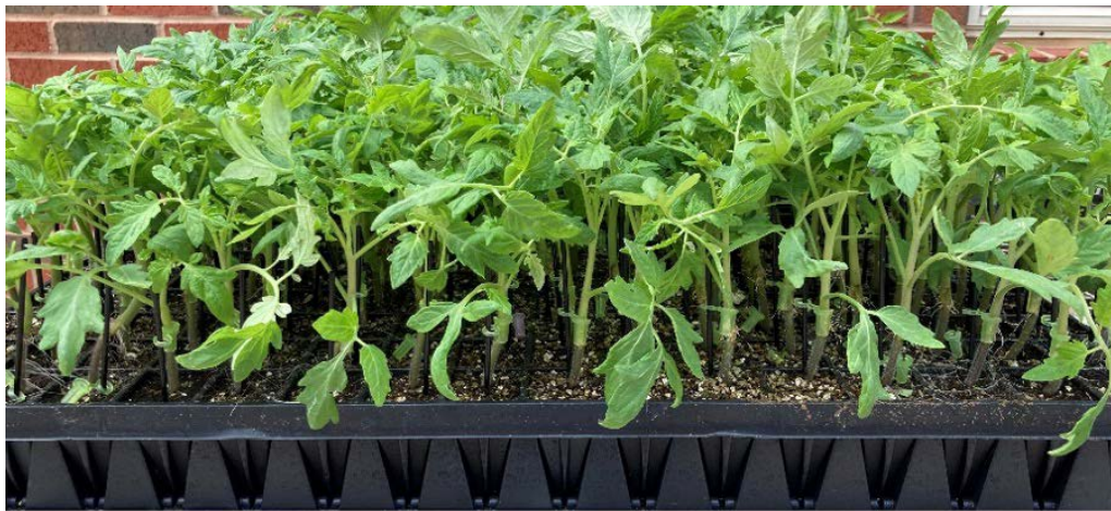
Figure 6. Grafted tomatoes completely healed and ready for transplanting to the field.