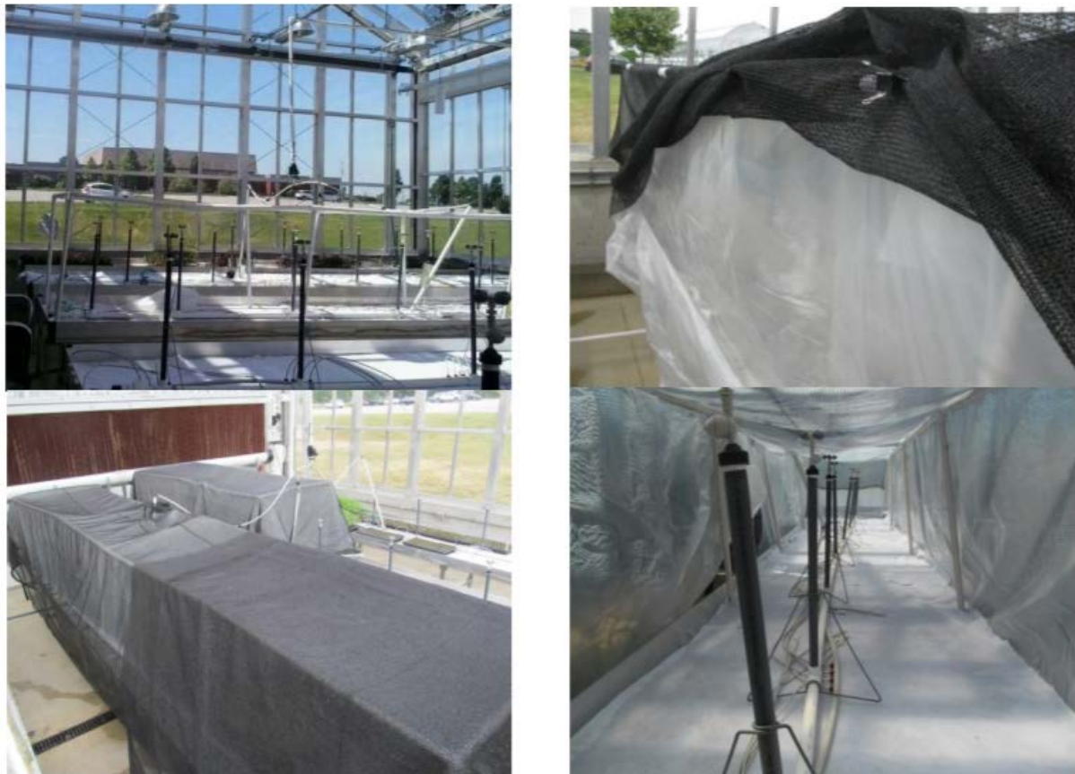
Figure 4. Healing chambers constructed using PVC covered by plastic and shade cloth.