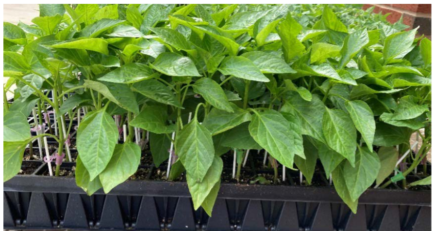
Figure 7. Grafted peppers completely healed and ready for transplanting to the field.

Oklahoma State University, as an equal opportunity employer, complies with all applicable federal and state laws regarding non-discrimination and affirmative action. Oklahoma State University is committed to a policy of equal opportunity for all individuals and does not discriminate based on race, religion, age, sex, color, national origin, marital status, sexual orientation, gender identity/ expression, disability, or veteran status with regard to employment, educational programs and activities, and/or admissions. For more information, visit https://eeo.okstate.edu .