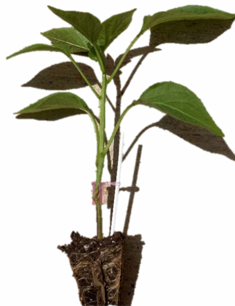
Figure 1. Grafted pepper using the splice method. The union is secured by a grafting clip.

This type of graft may also be called approach grafting. To begin, cut a forty-five-degree downward angle slit about half-way through the rootstock stem below the cotyledons. Make an upward angled slit in the scion at the same height as the rootstock. Bring the stems together so they overlap making