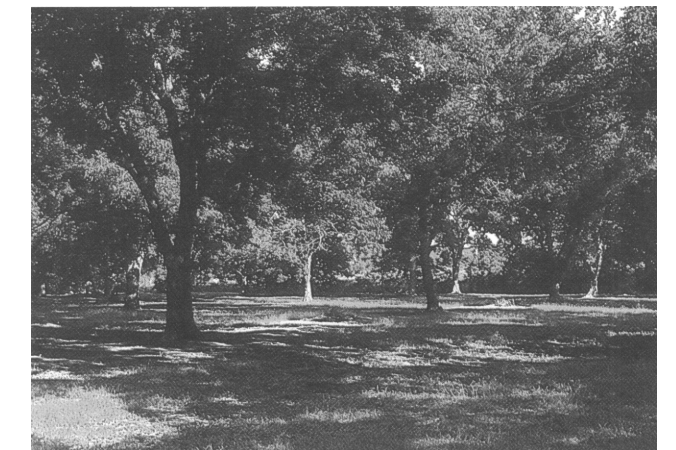
Figure 1. A grove that has been very productive for several years. The amount of shade on the ground indicates that the grove is becoming crowded, consequently nut production can be expected to decline annually unless tree removal is initiated soon.

During the 1950s, Oklahoma State University pecan researcher Herman Hinrichs determined the optimum stocking rate for maximum nut production. His research indicated that with Oklahoma growing conditions, about 30 square feet of cross-sectional trunk area was the optimum tree density recommended for one acre. A tree 14 inches in diameter at