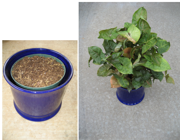
Figure 3. Use a “pot within a pot” technique to avoid overwatering pots without drain holes.

to OSU Extension Fact Sheet HLA-6413 for poinsettia care in the home.) Cacti and other succulents need to be allowed to remain dry a few days before watering, even though the top of the potting medium may be dry to the touch.