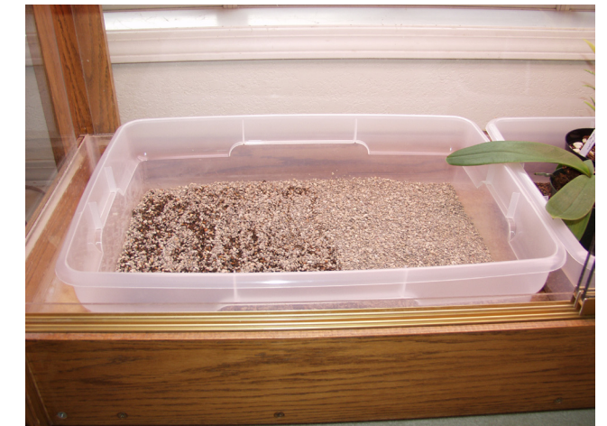
Figure 2. Increase humidity around houseplants by placing them on a tray of moist gravel or pebbles.

Oklahoma Cooperative Extension Fact Sheets are also available on our website at: http://osufacts.okstate.edu