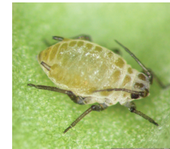
Figure 6. Aphid (left) and mealybugs (below) are common insect problems. (Photos highly magnified.)

Spider mites can also damage houseplants. These are red, black, brown, or tan pests that are about the size of a dust particle. They usually feed from the undersides of the leaves causing the top side to turn pale. They are a greater problem during periods of high temperature and low humidity. Showering your houseplants once or twice a month will help control these tiny pests.