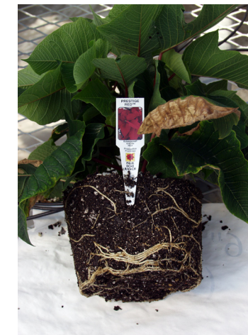
Figure 5. A healthy root system should be white and vigorous. Check the roots every 6 to 12 months.

An occasional “shower” will benefit most plants. The pleasing natural gloss of leaves is enhanced more by cleaning with water or with a weak solution of a mild soap than with leaf shining products; however, be sure to remove any soap residue with clear water. Small plants can be showered with water from the spray head at the kitchen sink, and larger plants can be showered with water in the bathtub or shower.