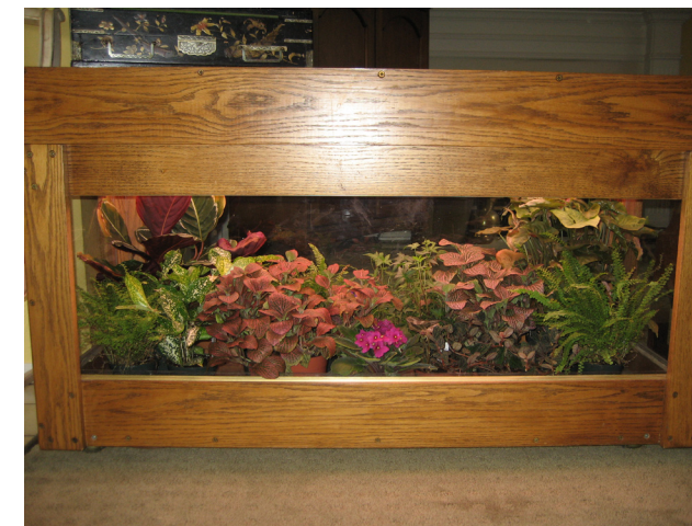
Figure 1. Grow houseplants in a Wardian case or under fluorescent plant lights if natural light is limited.

Avoid placing plants in hot spots or cold drafts. Almost none will survive the hot, dry air from a furnace vent, nor like being placed near a door where cold drafts enter.