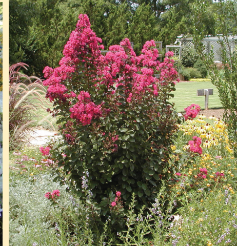
Pink Velour Crapemyrtle