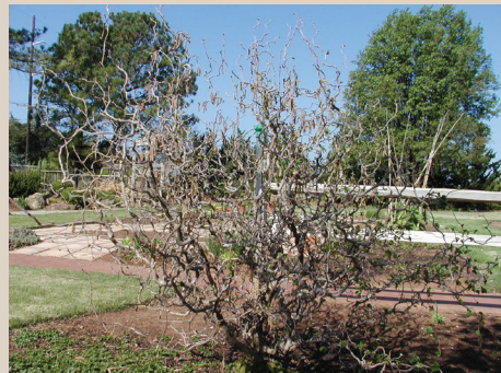
Harry Lauder's Walkingstick