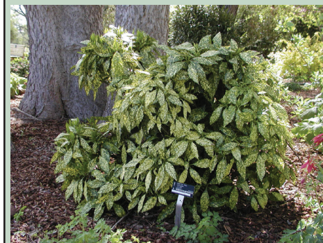
Aucuba – Gold Dust Plant