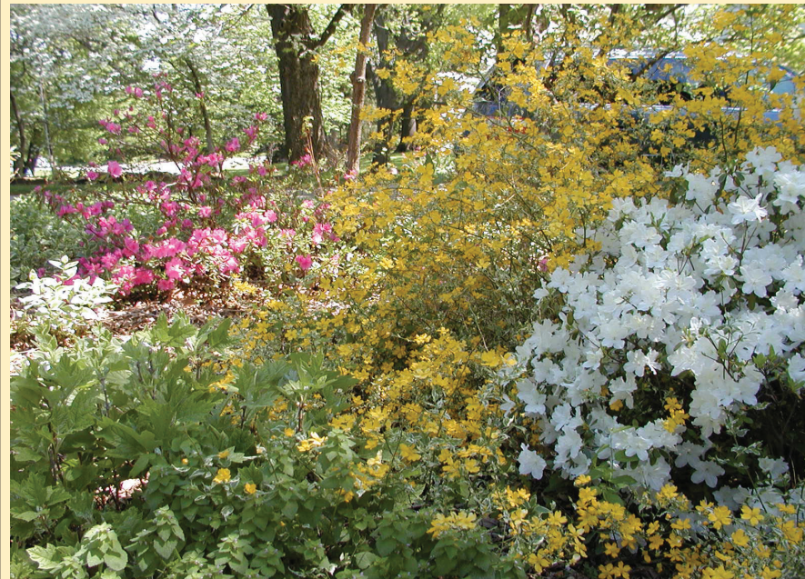
Azaleas and Japanese Kerria