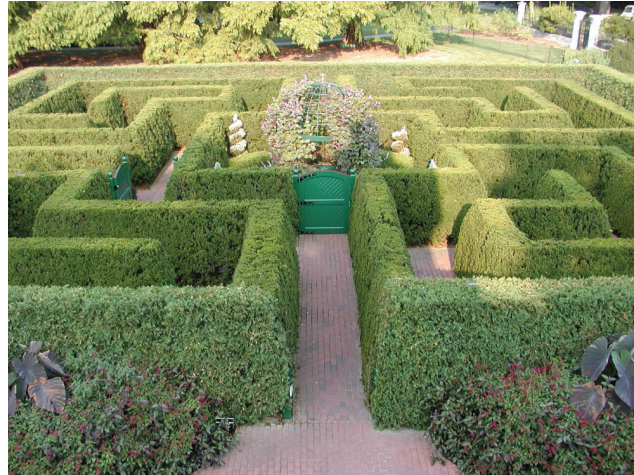
Shrubs pruned in a formal fashion can be used to create fun and creative garden designs.

Select shrubs hardy enough to survive the winter and durable enough to endure the Oklahoma summer heat.