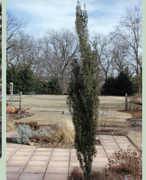
Pencil Yaupon Holly