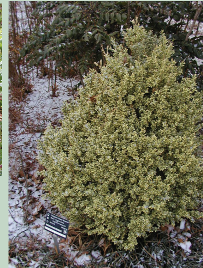
Green Mountain Boxwood