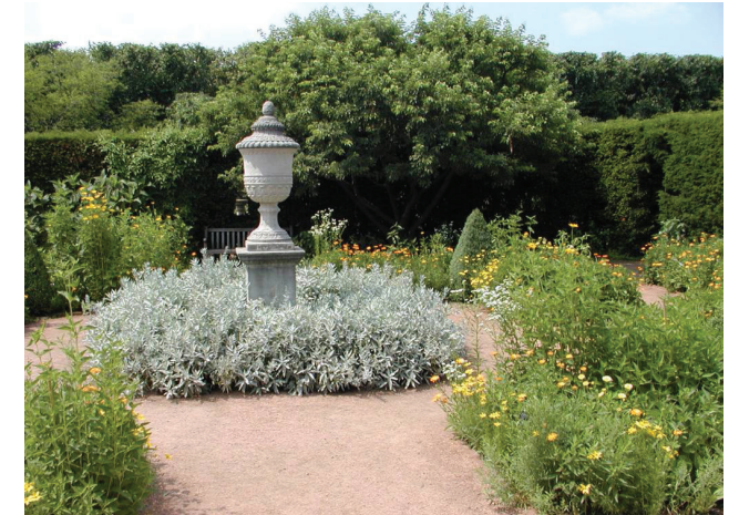
Shrubs can be used as living fences to delineate space and create garden rooms.

Oklahoma Cooperative Extension Fact Sheets are also available on our website at: http://osufacts.okstate.edu