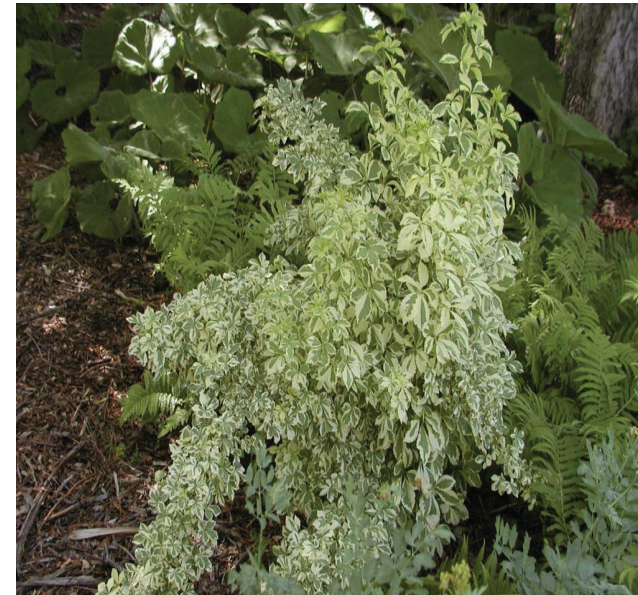
Shrubs with variegated foliage, like this five-leaf aralia, really stand out in shady areas.