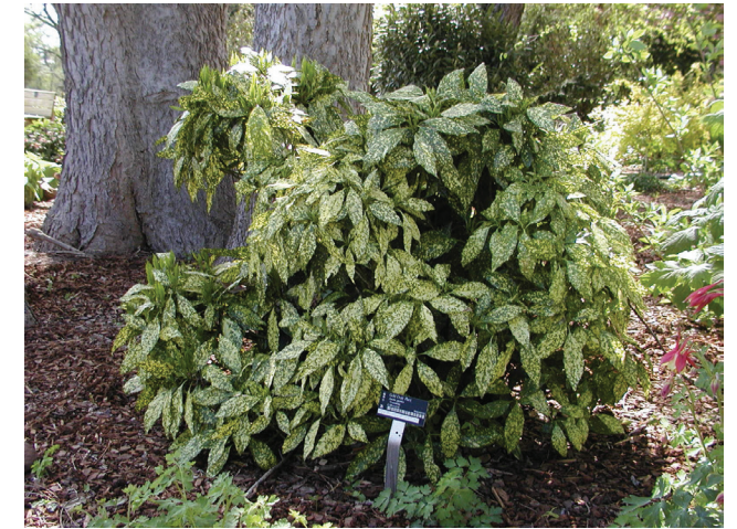
Aucuba or Gold Dust plant is excellent for heavily shaded areas.

Many of the plants listed below will thrive and remain green despite growing in high pH soils. However, when pH values exceed pH 8.0 or higher, it may be difficult to grow some of the species below.