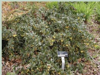
William Penn Barberry