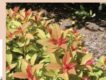
'Magic Carpet' Spirea