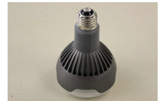
Figure 1. Heat sink and standard E26 light bulb base fitting of Philips® GreenPower LED flowering lamp.

There are different LED lighting devices (Figures 1, 2 and 3) and bulb types used in horticulture and each provide a specific need to plants and growers. Bulged reflectors,