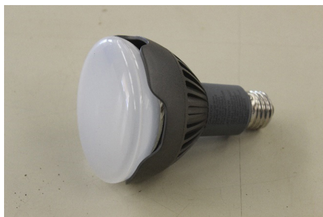
Figure 3. Philips® GreenPower LED flowering lamp.

tubular and miniature are the different bulb types. The different devices are toplights, inter-lights, tubular LEDs (TLEDs) and flowering lamps. Toplights, inter-lights and TLEDs are considered module lighting systems, which are for multi-layer production systems such as city (vertical) farming, tissue culture and indoor research facilities, such as grow rooms and growth chambers. Toplights have high lighting outputs and low heat emission and are used specifically for high wire and leafy vegetables. Interlights allow plants to receive light horizontally and vertically and are used for plants that rise such as cucumbers and tomatoes. TLEDs are replacement