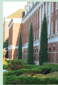
Taylor juniper ( Juniperus virginiana 'Taylor')

Arborvitae, Oriental ( Platycladus orientalis ) Chinafir ( Cunninghamia lanceolata )* Cypress, Arizona ( Cupressus arizonica ) Holly ( Ilex spp.) Juniper ( Juniperus spp.) Oak, Live ( Quercus virginiana )* Waxmyrtle, Southern ( Morella cerifera )