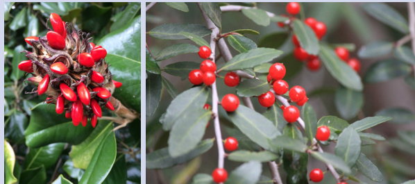
Fruit of yaupon holly.