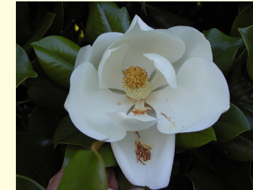
Southern Magnolia flower

Cherrylaurel, Carolina ( Prunus caroliniana ) Holly ( Ilex spp.) Juniper ( Juniperus spp.) Magnolia, Southern ( Magnolia grandiflora ) Magnolia, Sweetbay ( Magnolia virginiana )* Oak ( Quercus virginiana and Q. fusiformis ) Pine ( Pinus spp.) Redcedar, Eastern ( Juniperus virginiana ) Waxmyrtle, Southern ( Morella cerifera )