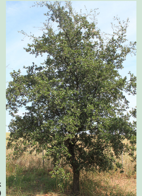
Escarpment Live Oak ( Qercus fusiformis )

Arborvitae, American or Eastern ( Thuja occidentalis ) Arborvitae, Giant Western Redcedar ( Thuja plicata ) Cherrylaurel, Carolina ( Prunus caroliniana ) California Incensecedar ( Calocedrus decurrens )* Cypress, Arizona ( Cupressus arizonica ) Holly, American ( Ilex opaca ) Holly, Yaupon ( Ilex vomitoria ) Juniper, Eastern Redcedar ( Juniperus virginiana ) Juniper, Rocky Mountain ( Juniperus scopulorum ) Magnolia, Southern ( Magnolia grandiflora ) Magnolia, Sweetbay ( Magnolia virginiana )* Pine, Eastern White ( Pinus strobus )* Pine, Limber ( Pinus flexilis )* Pine, Loblolly ( Pinus taeda ) Pine, Pinyon ( Pinus edulis )* Pine, Short Leaf ( Pinus echinata )* Pine, Slash ( Pinus elliottii )* Pine, Southwestern White ( Pinus strobiformis )* Pine, Virginia ( Pinus virginiana )* Oak, Live ( Quercus virginiana )* Oak, Escarpment Live ( Qercus fusiformis )* Waxmyrtle, Southern ( Morella cerifera )