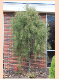
Threadleaf American arborvitae ( Thuja occidentalis 'Filiformis')

Arborvitae ( Thuja and Platycladus spp.) golden and blue foliage forms, columnar and threadleaf forms Cedar, Atlas ( Cedrus atlantica ) Golden, blue and weeping forms Chinatfir ( Cunninghamia lanceolata )* interesting foliage and bark on mature plants Cypress, Arizona ( Cupressus arizonica ) blue, gold and weeping forms Cypress, Italian ( Cupressus sempervirens )* fastigiated, golden forms Holly ( Ilex spp.) variegated and weeping forms Incensecedar, California ( Calocedrus decurrens )* interesting bark Oak, Escarpment Live ( Quercus fusiformis ) picturesque branching structure Pine ( Pinus spp.) blue, gold, weeping and columnar forms