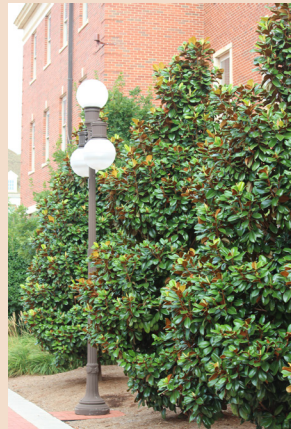
Teddy Bear® Southern Magnolia ( Magnolia grandiflora 'Southern Charm')

Arborvitae ( Thuja and Platycladus spp.) Cherrylaurel ( Prunus laurocerasus ) Cherrylaurel, Carolina ( Prunus caroliniana ) Chinafir ( Cunninghamia lanceolata )* Cypress ( Cedrus spp.), (x Cupressocyparis spp.)* and ( Cupressus spp.)* Falsecypress ( Chamaecyparis spp.)* Holly ( Ilex spp.) Incensecedar, California ( Calocedrus decurrens )* Juniper ( Juniperus spp.) Magnolia, Southern ( Magnolia grandiflora ) Pines ( Pinus spp.) Waxmyrtle, Southern ( Morella cerifera )