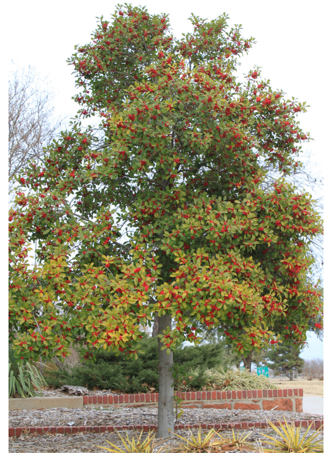
Foster Holly ( Ilex x attenuata 'Fosteri') in winter.

Finally, consider how much maintenance the plant will require and any possible disadvantages including susceptibility to attack by disease and insect pests, soft or brittle wood that