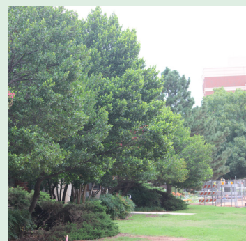
Cherrylaurel ( Prunus laurocerasus )

Cherrylaurel, Carolina ( Prunus caroliniana ) Cherrylaurel ( Prunus laurocerasus ) Falsecypress, Alaska-cedar or Nootka ( Chamaecyparis nootkatensis )* Holly ( Ilex spp.) Magnolia, Southern ( Magnolia grandiflora ) Magnolia, Sweetbay ( Magnolia virginiana )* Pine, Mugo ( Pinus mugo ) Spruce, Colorado ( Picea pungens ) Waxmyrtle, Southern ( Morella cerifera )