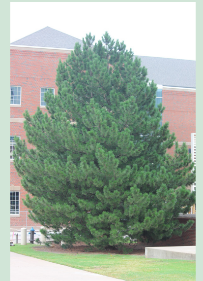
Austrian pine ( Pinus nigra )

Cherrylaurel, Carolina ( Prunus caroliniana ) Cypress, Leyland (X Cupressocyparis leylandii ) Falsecypress, Hinoki ( Chamaecyparis obtusa )* Falsecypress, Whitecedar or Altantic ( Chamaecyparis thyoides )* Holly, Yaupon ( Ilex vomitoria ) Juniper, Chinese ( Juniperus chinensis ) Magnolia, Southern ( Magnolia grandiflora ) Pine, Austrian ( Pinus nigra ) Pine, Bosnian ( Pinus heldreichii ) Pine, Japanese Black ( Pinus thunbergii ) Pine, Loblolly ( Pinus taeda ) Pine, Mugo ( Pinus mugo ) Pine, Scots or Scotch ( Pinus sylvestris ) Pine, Short Leaf ( Pinus echinata )* Pine, Slash ( Pinus elliotii )* Oak, Live ( Quercus virginiana ) Redcedar, Eastern ( Juniperus virginiana ) Spruce, Dwarf Alberta ( Picea glauca 'Conica') Spruce, Colorado ( Picea pungens ) Waxmyrtle, Southern ( Morella cerifera )