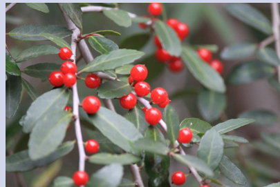
Yaupon holly ( Ilex vomitoria )

Arborvitae, American or Eastern ( Thuja occidentalis ) Arborvitae, Giant or Western Redcedar ( Thuja plicata ) Holly, American ( Ilex opaca ) Holly, Yaupon ( Ilex vomitoria ) Magnolia, Southern ( Magnolia grandiflora ) Magnolia, Sweetbay ( Magnolia virginiana )* Oak, Live ( Quercus virginiana )* Pine, Loblolly ( Pinus taeda ) Waxmyrtle, Southern ( Morella cerifera )