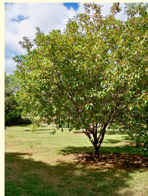
Carolina Cherrylaurel ( Prunus caroliniana )

Cherrylaurel, Carolina ( Prunus caroliniana ) Falsecypress ( Chamaecyparis spp.)* Holly ( Ilex spp.) Juniper ( Juniperus spp.) Magnolia Southern (dwarf selections) ( Magnolia grandiflora ) Pine, Mugo (dwarf forms) ( Pinus mugo )