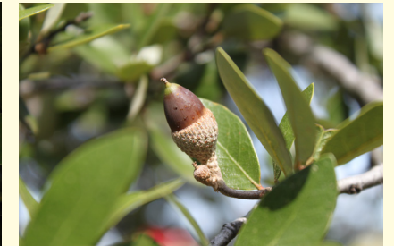
Escarpment Live Oak acorn