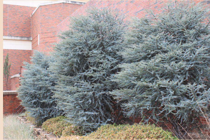
Horstmann blue atlas cedar ( Cedrus atlantica 'Horstmann')

Cedar, Atlas ( Cedrus atlantica ) Cedar, Deodar ( Cedrus deodara ) Cedar, Lebanon ( Cedrus libani )* Cherrylaurel, Carolina ( Prunus caroliniana ) Cypress, Arizona ( Cupressus arizonica ) Cypress, Italian ( Cupressus sempervirens )* Holly ( Ilex spp.) Junipers ( Juniperus spp.) Pine, Austrian ( Pinus nigra ) Pine, Japanese Black ( Pinus thunbergiana ) Pine, Limber ( Pinus flexilis ) Pine, Pinyon ( Pinus edulis )* Pine, Ponderosa ( Pinus ponderosa ) Redcedar, Eastern ( Juniperus virginiana ) Waxmyrtle, Southern ( Morella cerifera )