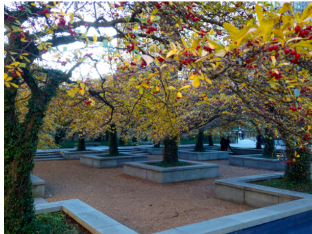
Figure 6. Art Institute of Chicago, South Garden designed by Dan Kiley.