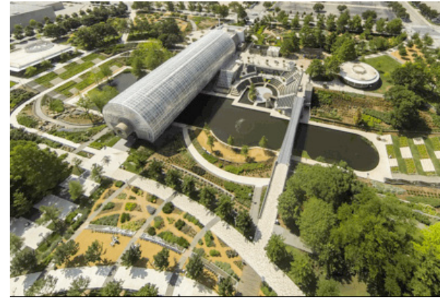
Figure 9. Myriad Botanical Gardens, Oklahoma City, OK designed by OJB.