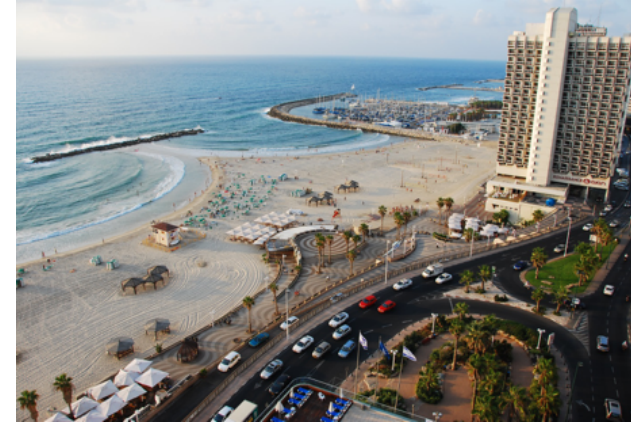
Figure 7. Mediterranean Sea ocean front in Tel Aviv, Israel.