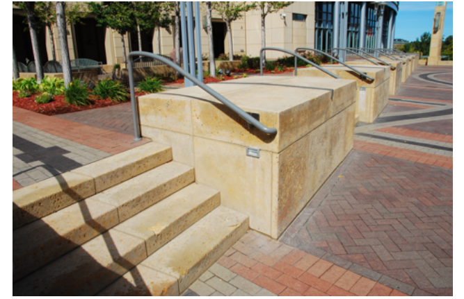
Figure 10. Reinforced retaining wall as part of the security design at the front of Federal Reserve Bank of Minneapolis.