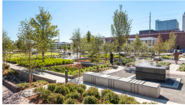
Figure 1. Guthrie Green, Tulsa, OK designed by SWA