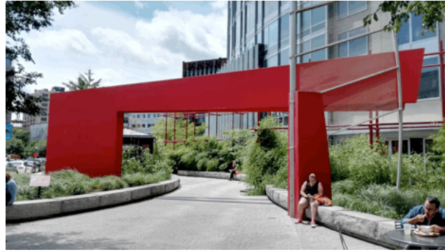
Figure 2. Chinatown Park, Boston, MA designed by Carol R. Johnson Associates (CRJA-IBI)