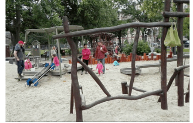
Figure 8. Alexander W. Kemp Playground at Cambridge Common, Harvard Square, Massachusetts