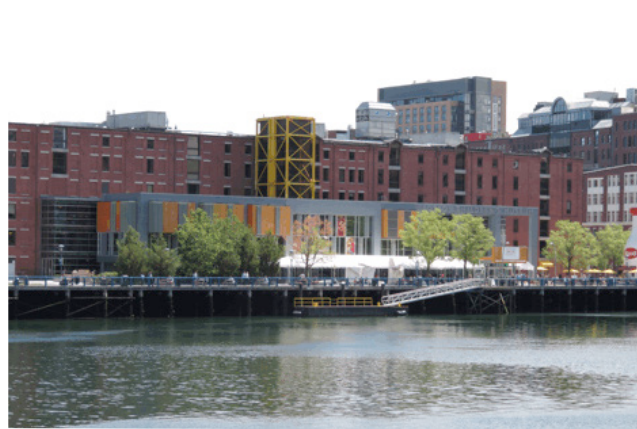
Figure 4. Urban plaza at Boston Children's Museum designed by Michael Van Valkenburgh Associates