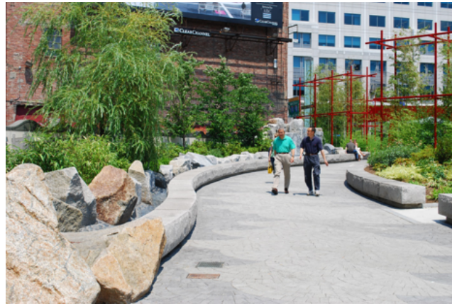
Figure 3. Chinatown Park, Boston, MA designed by Carol R. Johnson Associates (CRJA-IBI)