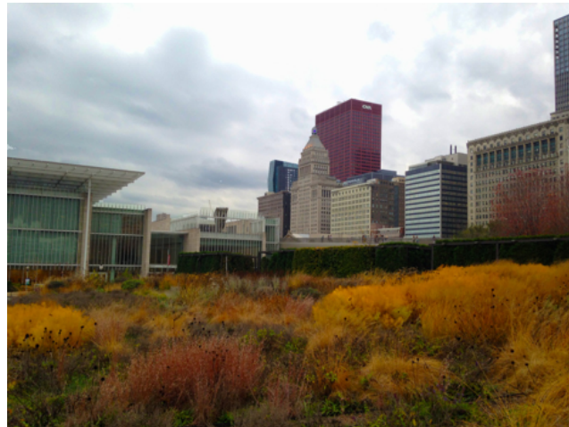
Figure 5. Lurie Garden in Millennium Park at fall, Chicago designed by Gustafson Guthrie Nichol Ltd & Terry Guen Design Associates, Inc.