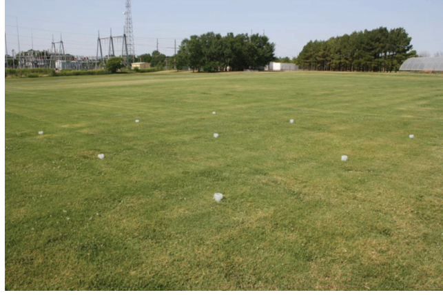
Figure 3. Examples of how to layout the irrigation catch cups in a grid pattern with each cup located about three steps apart from each other.