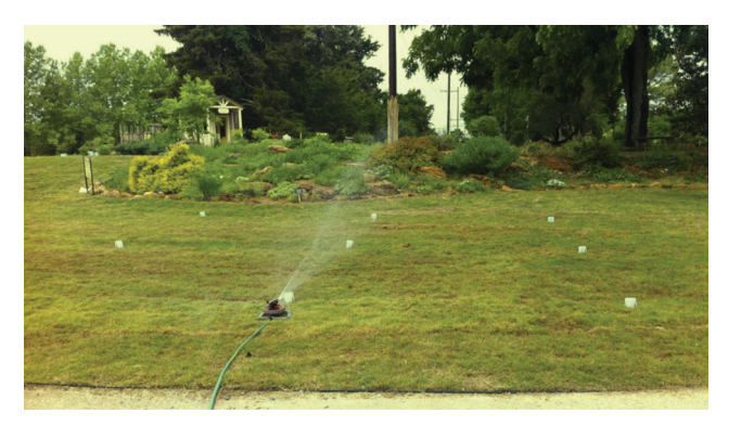
Figure 4. Proper placement of the catch cups in relation to your typical sprinkler location is imperative to obtain accurate irrigation output measurement.

about three steps, and place another catch cup. When you finish making your irrigation collection grid, it should appear as a square pattern (Figure 3). It is not necessary that these catch cups are measured out precisely.