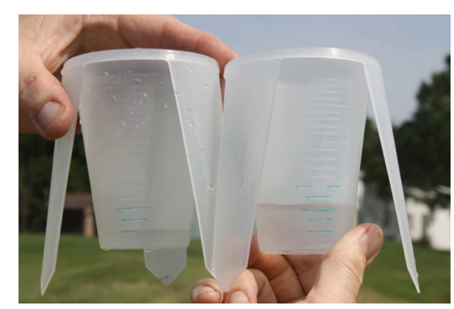
Figure 5. Note the relative uniformity of your irrigation output across the irrigation catch cup grid. If there is too much variation in the sprinkler pattern, you may need to hire a professional to adjust your irrigation system.

1. To get the average output of your sprinkler(s) or automatic system, you need to do some basic math. Take the total