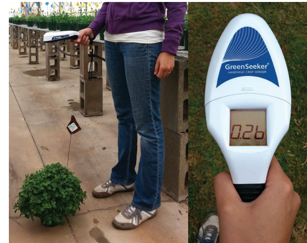
Figure 2. GreenSeeker™ handheld sensor.

For greenhouse growers, this device has some drawbacks; it can only sense the canopy accurately in the vegetative phase, as colors (derived from flowers or coloring bracts) disrupt the readings because of the color reflectance. Another problem would be the background noise that the sensor detects due to its wide field of view. Background noise comes from media