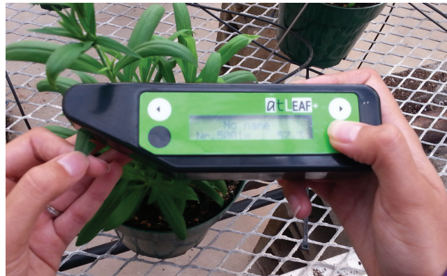
Figure 4. atLEAF+ meter.

species names that are up to 35 characters long. This makes it easier for growers and researchers who are investigating different species to store their data. It is also convenient that the measurements collected can be transferred to a computer using the USB mode. Users can use the keys on the device to: view stored measurements, delete recent data, clear all data, and transfer the data to a PC. The producers of this device claim that the readings of the device are as accurate as SPAD readings. On their website, there is an atLEAF+ to SPAD conversion application. Recent studies conducted at Northwest Agriculture & Forestry University in China, have shown promising results in canola, potato, corn, wheat, and barley. It is suggested as an inexpensive alternative to the SPAD meter. This sensor is suitable for use on trees, shrubs, vines, field crops, and greenhouse crops.