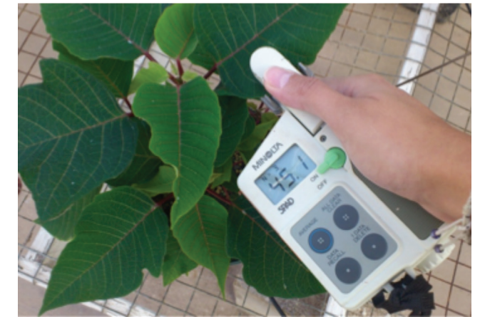
Figure 3. SPAD-502 meter.

Chlorophyll content of a leaf can be estimated by inserting a leaf between the clamps of the SPAD aperture. When the clamps are closed, two LEDs diodes send beams of light at two wavelength regions, red at 650 nm and near NIR at 940 nm. A silicon photodiode measures the absorbance of the