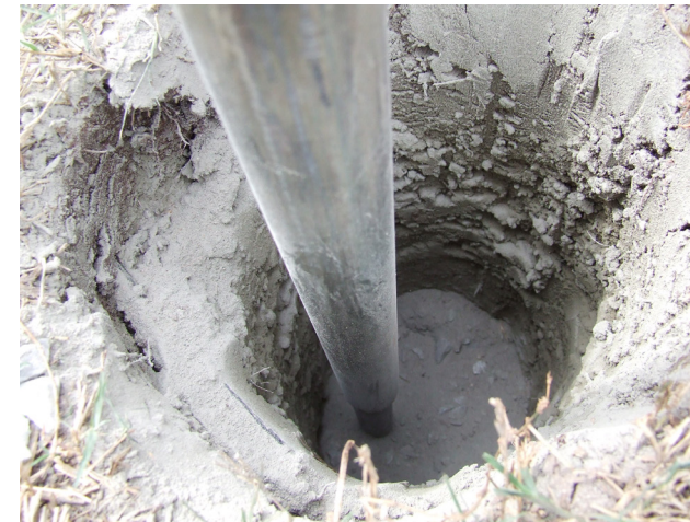
Figure 6. High tunnel poles set in concrete.

are generally from the southwest in the summer and from the north in the winter, but specifics must be determined for each site by accessing Oklahoma climatology data ( http://climate.ok.gov/index.php/climate ). High tunnels placed perpendicular to prevailing winds typically receive the most damage.