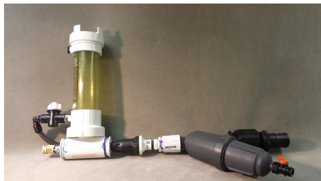
Figure 7. Injector system to add fertilizer through irrigation lines.

becomes a persistent problem, consider incorporating organic matter or other soil amendments to help improve overall soil drainage.