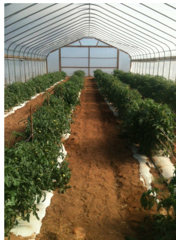
Figure 8. Tomato production in a high tunnel.

Warm-season crops such as tomatoes are almost exclusively grown in high tunnels in certain parts of the country (Figure 8). In New England, farmers have been using high tunnels for tomato production for more than a decade. Unpredictable summer weather and wind-transferred fungal diseases were the primary drivers behind this practice. High tunnels allow tomatoes to be staked or trellised, which can help increase tomato production and limit waste from soil