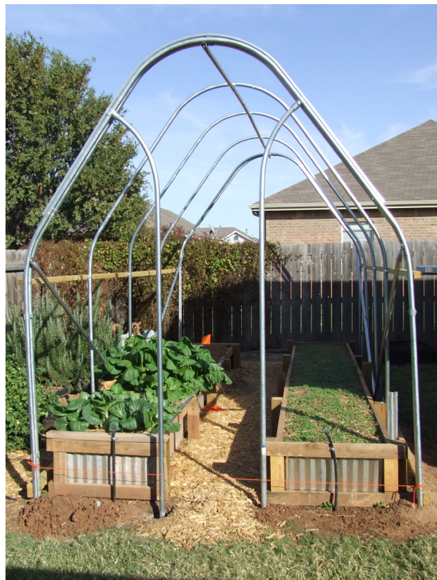
Figure 4. A small hobby high tunnel.

Because high tunnels are lightweight structures that lack a solid foundation, the poles must be well anchored in the soil. For non-movable high tunnels, the frame poles should be sunk 2 feet to 3 feet into the ground to provide support during storms and high winds (Figure 6). For movable high tunnels, anchor posts must be sunk, and the structure attached to