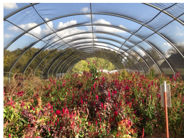
Figure 3: High tunnel with only a shade cloth covering.

dimensions for high tunnel size, they typically range from 14 feet x 30 feet up to 30 feet x 96 feet and can vary in design (Figure 5). Some growers elect to construct their high tunnels on skids so they can move the structure for crop rotational purposes.