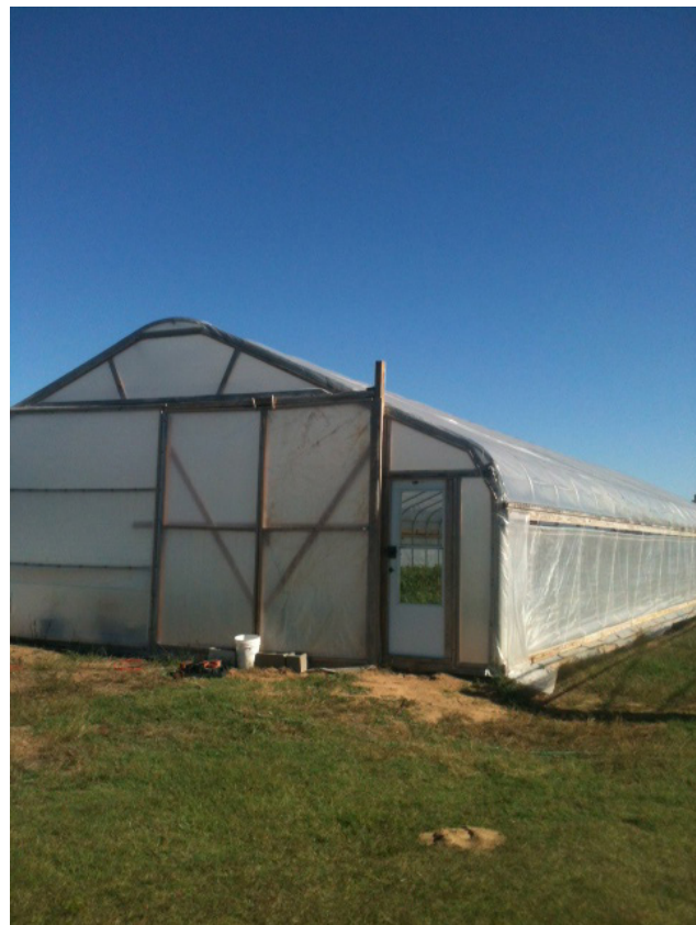
Figure 2. High tunnel with plastic covering.