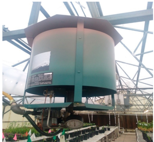
Figure 3. Carbon dioxide generator manufactured by Johnson Gas Appliance Company (Iowa). The generator operates with either propane or natural gas and has pressure gauge to control the size of burner.

Combustion of hydrocarbon fuels generally produces CO 2 , water and heat. Greenhouse operators can use small CO 2 generators operated with propane or natural gas. Burning one pound of fuel can produce 3 pounds of CO 2 . One pound of CO 2 is equivalent to 8.7 cu. ft. of gas at standard