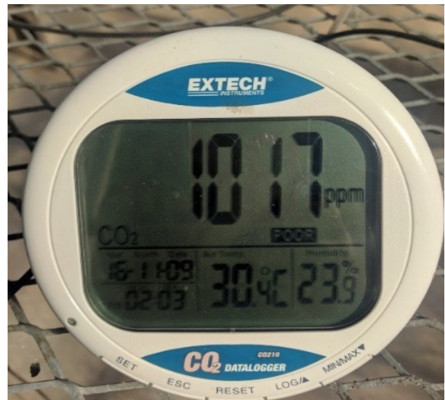
Figure 5. Extech CO 2 Monitor (FLIR Commercial Systems Inc., Nashua, NH) and data logger. It measures CO 2 , temperature and humidity and has 15,000 data log storage capacity.

Dry ice is one of the cheapest methods adopted by growers in smaller greenhouses. In advanced greenhouses, special cylinders with a gas flowmeter are used to control CO 2 regulation through sublimation of dry ice. Dry ice is a solid state of CO 2 obtained by keeping CO 2 at an extremely low temperature (minus 109 degrees fahrenheit). Slow release of dry ice may help in cooling small hobby greenhouses by a few degrees in the summer. In general, about 1 pound of dry ice is enough to maintain 1,300 ppm of CO 2 in a 100-sq. ft. area throughout the day. In a normal greenhouse, dry ice is sliced into small pieces and replaced every two hours to maintain a desired level of CO 2 or kept inside an insulator with small holes through which CO 2 escapes. It is cheap, readily available and roughly costs between $1-$3/lb. and can last for a whole day. Since it has an extremely low temperature, it should be handled with care. The major disadvantages are low self-life and difficulty in storing at normal conditions. Rapid sublimation of dry ice may lead to increase level of CO 2 higher than 2,000 ppm, which could limit growth as well could be toxic to plants.