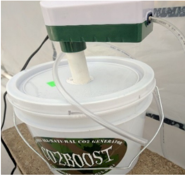
Figure 4. CO 2 boost Bucket with pump that helps to control CO 2 concentration. Formulation is based on the microbial activity inside the bucket.

temperature and pressure. At this rate, 5 oz. of ethyl alcohol per day is required to maintain 1300 ppm of CO 2 for a 200-sq. ft. room. The amount of CO 2 produced depends on the type and purity of fuel. But combustion without adequate oxygen may produce impurities which are harmful to plants. So, smaller areas should be opened for fresh air even in sealed greenhouse conditions. These generators are kept just above the plants and each unit covers about 4,800 sq. ft. of area and costs between $1,000-$2,500 plus an additional $1,000 for gas and electrical installation (Fig. 3). The CO 2 burner capacity ranges from 20,000-60,000 Btu/hr and can produce 8.2 pounds of CO 2 per hour by burning natural gas.