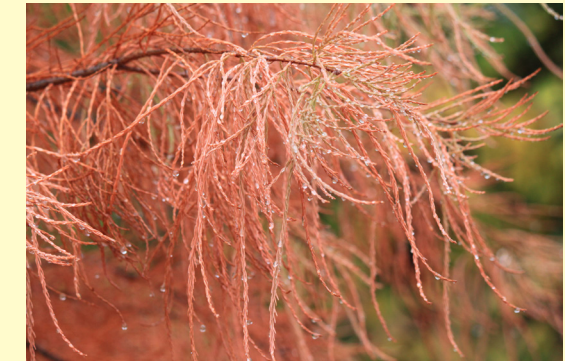
Baldcypress fall color