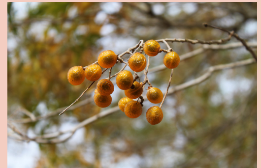
Fruits of Western soapberry