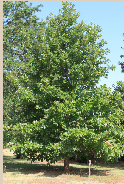
Swamp white oak