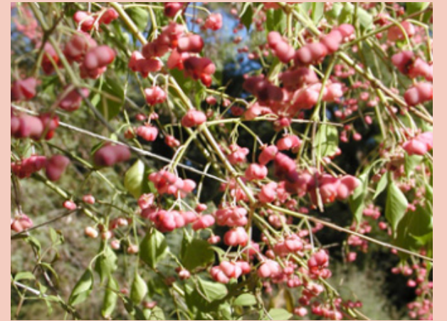
Fruits of winterberry euonymus