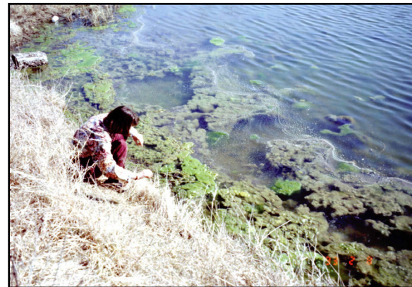
Figure 2. Excessive algae may look like moss, clumps or floating mats.