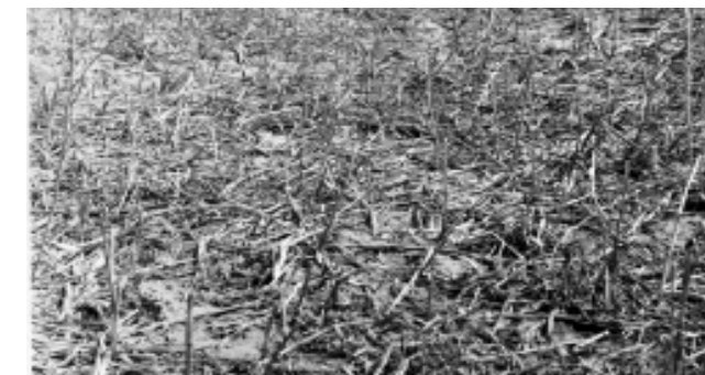
Figure 1. On highly erodible croplands, planting into a non-competitive cover crop like sorghum is more desirable than using a clean-filled seedbed.

Since much of the acreage seeded to grass is on more or less “critical” areas, i.e. highly erodible, clean-tilled seedbeds are not always feasible. On this type of site, the role of