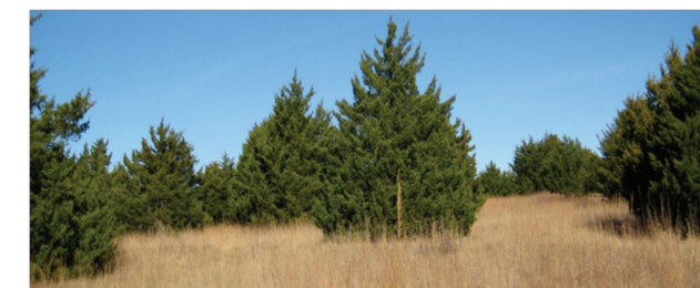
Figure 1. Encroachment of redcedar in a mesic grassland at OSU's Cross Timber Experimental Range near Stillwater.

Water enters watersheds as precipitation, primarily rainfall in Oklahoma. A portion of the precipitation is captured by the vegetative canopy (redcedar or grass) and the litter layer and evaporates back into the atmosphere. The evaporative loss of water from the vegetative canopy or litter is called interception. The remaining water will either infiltrate into the soil or produce