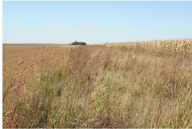
Field buffers around crop fields increase the carrying capacity of the land for pheasants. Wider buffers (more than 60 feet) planted to diverse mixes of native grass, forbs, and legumes can be used by nesting hens and broods. Additionally, birds can forage in the adjacent crop residue during the winter especially if native shrubs are present in the buffer.