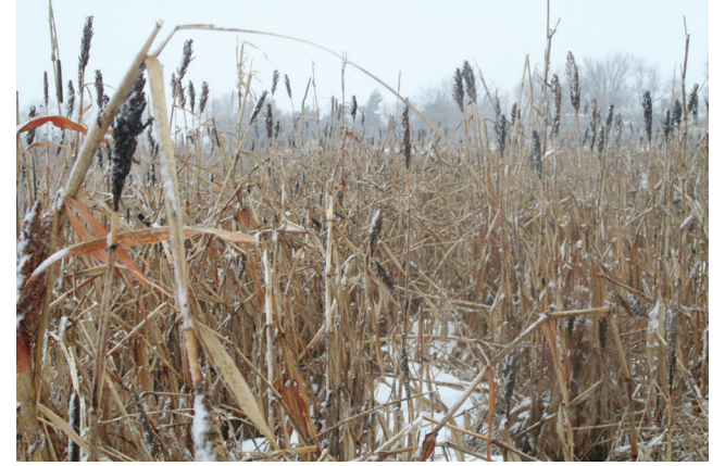
Food plots are rarely needed in agriculturally dominated areas and should only be implemented after all other habitat issues have been addressed. The food plot above, composed of both grain and forage sorghums, provides standing food above the snow and excellent winter cover because the taller forage sorghums fall over and lodge, similar to a cattail dominated wetland.