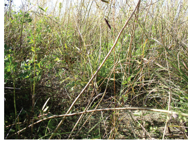
An example of good pheasant brood cover. While there is overhead cover, the ground is fairly open to allow movement of chicks. Also notice the abundance of forbs which will harbor the insects that chicks require.

Brood rearing habitat is crucial for pheasant reproduction. Pheasant chicks feed almost exclusively on insects during the first few weeks of life. To increase the abundance of insects, a site should have abundant forbs and legumes. Some forbs and legumes complete their life cycle early in the season, others late. Also, precipitation influences which plants are abundant from year to year. Thus, it is important for brood habitat to have a diverse plant community, so that throughout the summer there will be insect and seed bearing plants present. Some agricultural plants, such as alfalfa, have high numbers of insects as well, assuming that pesticides are not used and haying is not conducted during the brood rearing season (May to August). Harvested winter wheat can provide brood rearing cover provided the stubble is more than 10 inches, remains undisked through the summer, and herbicides are not applied to control summer weeds. Wheat stubble and annual forbs provide cover, insects, and seed for pheasant adults and chicks. The structure of the brood habitat also is important.