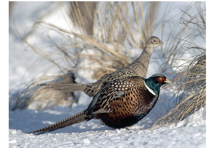
Pheasants are one of the most popular game birds in Oklahoma and the U.S.