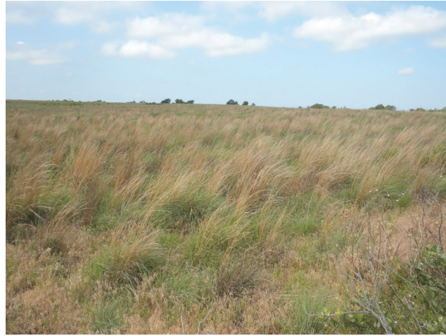
Dense grass cover such as this native CRP field provides excellent nesting habitat for pheasant.

Nesting cover is often limiting for pheasants, particularly in areas with intensive farming. Pheasants nest in dense grass cover. As pheasants nest early in the summer, it is important that residual grass cover remain from the previous growing season.