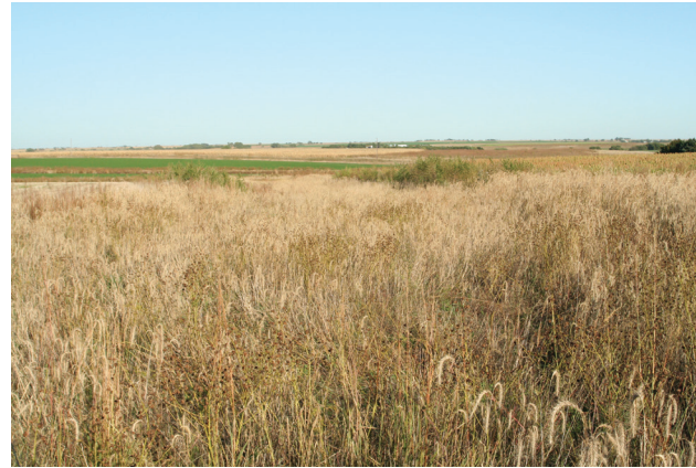
This waterway, was planted to a mixture of native warm season and native cool season grasses, such as switchgrass and big bluestem, rather than introduced grasses. After establishment, it will provide good nesting cover for pheasants and excellent winter and travel cover as it provides a lot of edge for pheasants to feed in adjoining crop fields while still being close to cover (Photo by Jason Sykes, Pheasants Forever).