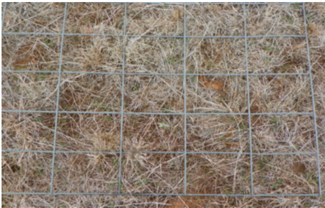
Figure 2. Dormant Old World bluestem pasture with drought damage.