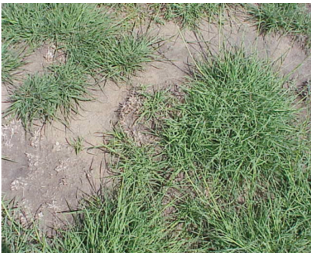
Figure 4. Weeping lovegrass pasture with damage following emergence.

these stands remain thin into the fall, it may be preferable to overseed with an adapted pasture legume or winter annual grasses. Complete recovery in these pastures may require two to three months of uninterrupted growth.