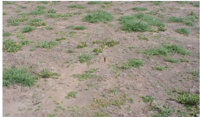
Figure 6. Old World bluestem pasture with severe damage following emergence.

for adequate recovery (Figures 5 and 6). Similar to the other drought-damaged pastures, these should also fully recover with weed control, proper soil fertility, and deferred grazing or harvest.