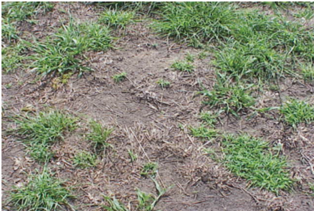
Figure 3. Old World bluestem pasture with damage following emergence.