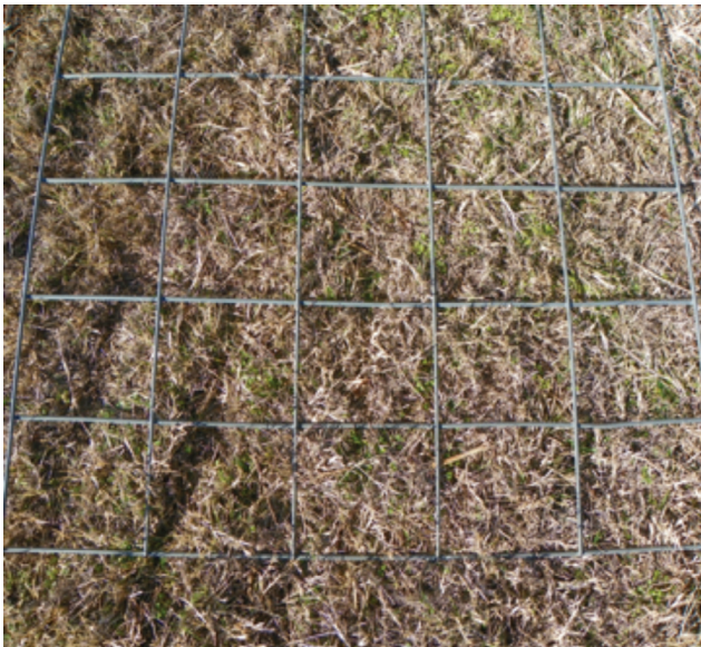
Figure 1. Example of a 5 x 5 frequency grid constructed from a used cattle panel.

To use the frequency grid, count the number of squares that contain a desirable live (green) plant. Any portion of a desirable live plant within a square counts as "1" plant regardless of the number of plants within each square. Weeds can be counted separately to estimate weed pressure.