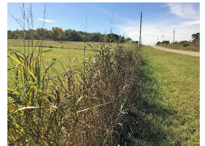
Figure 1. Established Johnsongrass along a fence line.

Oklahoma Cooperative Extension Fact Sheets are also available on our website at: http://osufacts.okstate.edu