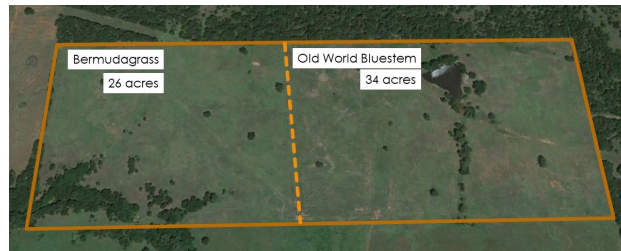
Figure 3. Forage community assessment.

The first step was to assess the forage community in the pasture, the producer noted that the west side of the field was dominated by bermudagrass and the east side was populated by old world bluestem stands. Based on observations, he concluded that the pasture needed to be divided into two sub-pastures as illustrated in (Figure 3).