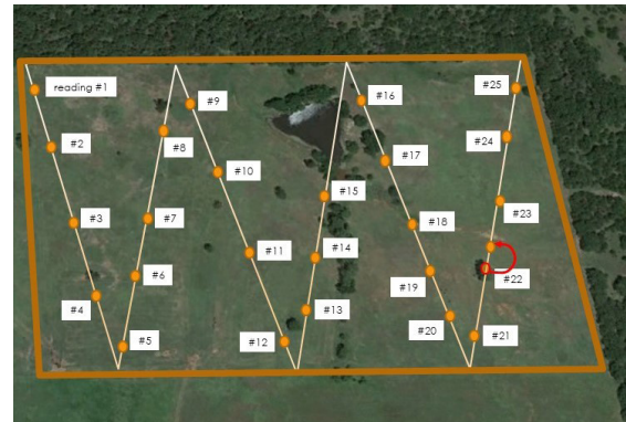
Figure 4. Reading collection plan.

The second step was to develop a reading collection plan for the east sub-pasture. Due to moderate variations in forage stands, he decided to take 25 readings every 75 steps in a zig-zag pattern. His reading plan collection is illustrated in (Figure 4).