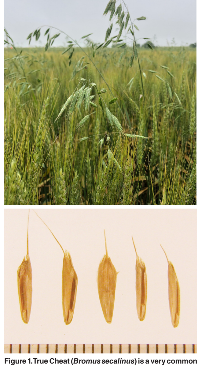
weed in Oklahoma wheat fields. At maturity, true cheat has short awns that distinguish it from downy brome.