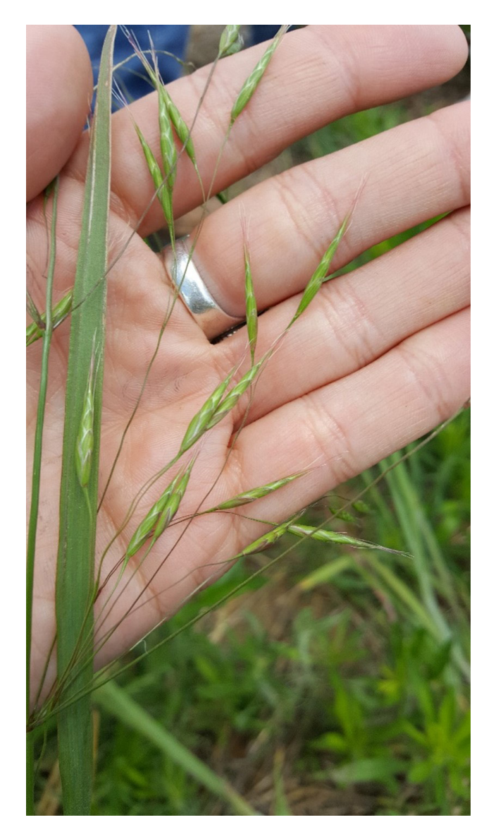
Figure 4. Japanese brome: open, nodding panicle with long, bent awns and a floret similar to true cheat.

PowerFlex® has a three-month rotation restriction to soybean and nine-month rotation restriction to canola, corn, grain sorghum and sunflower.