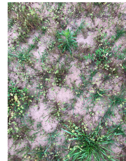
Figure 1. Overhead view of small grain cover crop mix (left) compared to an overhead view of a fallow area (right). Pictures were taken immediately prior to burndown. Note the significant reduction in weed population with cover crops compared to the fallow ground.

Oklahoma State University, as an equal opportunity employer, complies with all applicable federal and state laws regarding non-discrimination and affirmative action. Oklahoma State University is committed to a policy of equal opportunity for all individuals and does not discriminate based on race, religion, age, sex, color, national origin, marital status, sexual orientation, gender identity/ expression, disability, or veteran status with regard to employment, educational programs and activities, and/or admissions. For more information, visit https://eeo.okstate.edu .