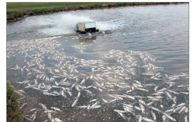
Figure 1. The price of poor water quality management is dead or sick fish.

The most critical technical factor in aquaculture is water quality. Oxygen levels in water can drop quickly and suffocate fish. Dissolved wastes produced by fish can build up in water, damaging delicate gills and elevating levels of harmful substances in the bloodstream. Fish farmers can deal with these dangers, but only after they have learned how to use water quality test equipment. The Cooperative Extension Service in most southern states offers water quality workshops for fish farmers. These workshops provide hands-on experience using test equipment and teach what the water quality numbers mean and what management actions to take (see SRAC Publication Nos. 370, 371, 462, 463, and 464). New fish farmers who delay buying and learning to use test equipment often believe the warnings do not apply to them. Then suddenly they discover an entire pond of dead or sick fish (Figure 1). Producers who take the time to check oxygen, ammonia, nitrite, and other water quality factors on a regular basis find that it pays off by greatly reducing fish kills and disease problems.