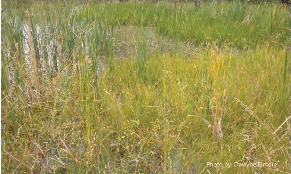
The seeds of these native moist-soil plants provide an excellent food source for waterfowl as well as support a diverse group of invertebrates that waterfowl need to complete their diet.