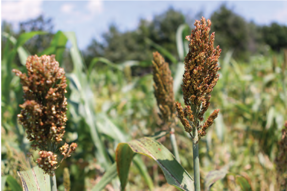
Grain sorghum can produce large quantities of seed that is readily used by waterfowl.

(see sidebar: Federal Regulations for Baiting Dove and Waterfowl on page 48). Wheat planted in the fall can attract geese, American wigeon and other species.