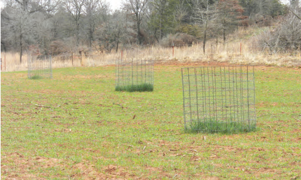
Establishing enclosures is a good way to monitor forage growth and utilization of food plots. These enclosures clearly show the plot has been heavily utilized.

Enclosures allow a manager to determine how much forage the plot produces over the season. In areas where deer densities are high and food availability is low, food plots often will be over utilized, with no obvious plant material from the planted species. In the absence of enclosures, it would be easy to assume the planting failed when in fact, it was over utilized by wildlife.