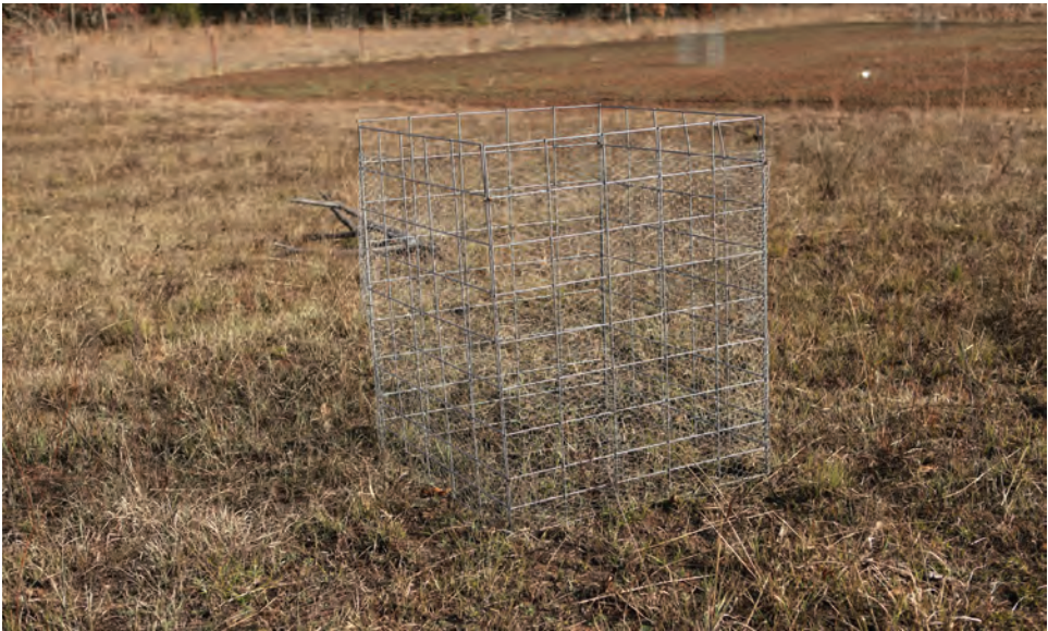
A low cost exclosure can be constructed from welded wire panels wrapped in chicken wire.

To determine whether food plots are providing the desired amount of forage and to estimate the level of utilization by wildlife, exclosures should be placed in the plots. Exclosures should be about 4 feet in diameter and 4-5 feet tall. An exclosure can be constructed from a 16-foot welded wire livestock panel wired together at the ends to make a circle or cut into fourths to make a square and then wrapped with small wire mesh or chicken wire. It is important to use some type of small wire mesh on the exclosure to keep animals from reaching through and to exclude rabbits from eating the forage inside the cage. Exclosures also should be staked down with t-posts driven into the ground firmly to prevent deer, feral hogs or wind from knocking them over.