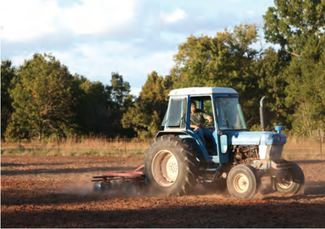
Conventional tillage is most often used to create a suitable seedbed for a food plot.

is too loose. A cultipacker is excellent for firming a seedbed. Seed drills will often have packer wheels that help with this problem as well.