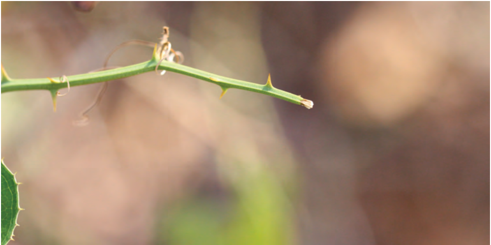
The tips of this greenbrier have been browsed by deer. Greenbrier is a highly preferred, native forage for white-tailed deer.

availability of many deer food plants while food plots increase production and availability of only a few deer foods. Prescribed fire can put woody browse plants within reach of deer (at heights less than 5 feet) and temporarily improves browse nutritional quality. Using a patch-burn rotation (an approach that involves burning a portion of the property each year) provides habitat that varies in structure and composition. A recent burn intermixed with patches having 2, 3, 4 and more years following fire provides areas with diverse plant maturities and associated qualities. This benefits white-tailed deer by providing a diversity of high quality foods and year-round as well as thermal, escape, and fawning cover.