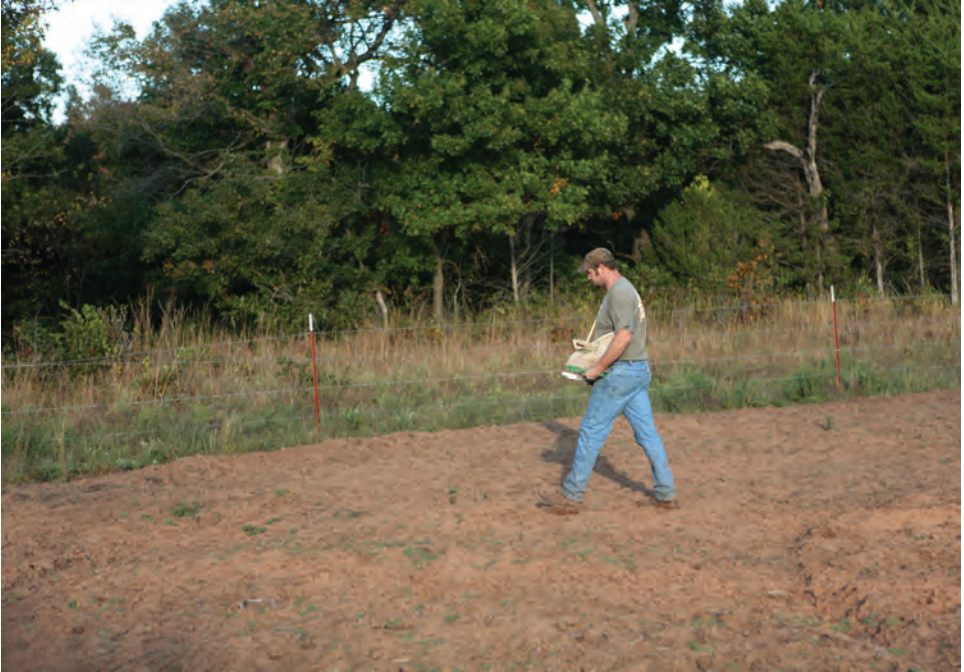
A soil analysis determined nitrogen and phosphorous were needed to correct deficiencies in this soil. A hand spreader works fine for small food plots such as this.

Lower values indicate acid soils and higher values indicate alkaline soils. Soil pH level is one of the most important properties that affect the availability of nutrients for plants. Most plants prefer neutral or slightly acidic soils. The application of lime will raise pH levels to correct acidity, while sulfur can be used to lower pH to correct alkaline soils.