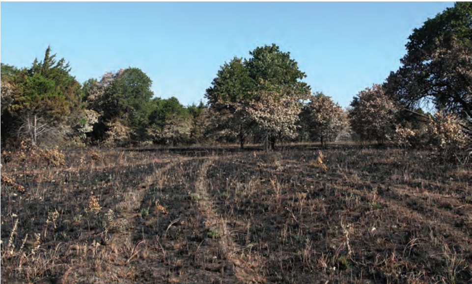
Recently burned areas are magnets for wild turkeys. They feed and display in these open areas.

Annual home range of wild turkeys can be as large as 10,000 acres, while daily movement patterns through their home range can be 2 to three 3 and cover 200 to 1,000 acres. Movement patterns and home range size varies depending on season and food availability. Similar to deer, most managers do not control enough land to meet all of a turkey's habitat needs. Habitat needs vary throughout the different seasons.