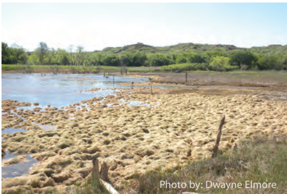
This photo was taken in early summer after the pond was drawn down to allow native moist-soil plants to establish before re-flooding in the fall.

Moist-soil management involves draining or partially draining wetlands in the spring and summer months to expose mud flats where native plants germinate and establish before re-flooding in the fall or winter. The plants that germinate and grow following a water drawdown vary depending upon on timing of drawdown, seed bank present, extent of the drawdown,