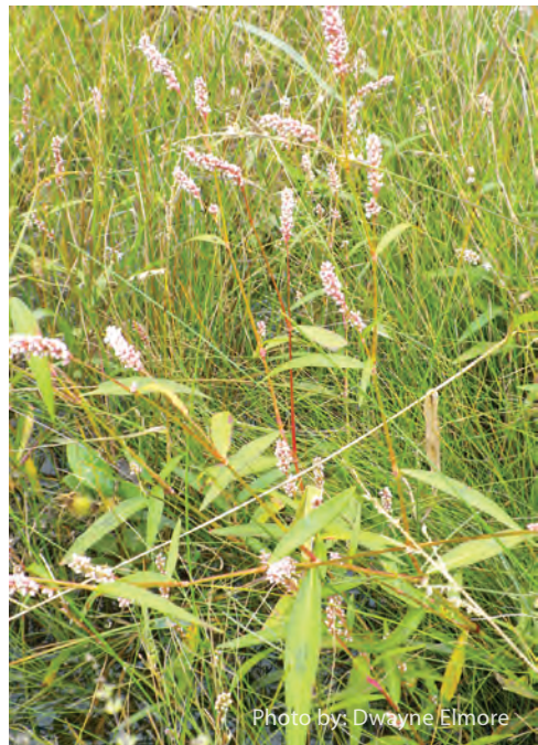
Smartweed, a native moist-soil plant, supports a diversity of invertebrates and provides seeds that are slow to deteriorate during winter.

Moist-soil plants are those that typically grow in wetland soils. Their foliage and seeds persist longer after flooding than most agriculture crops. Most agricultural crops deteriorate by 50 percent or more after being flooded for 90 days whereas native plants, such as smartweed, deteriorate about 20 percent or less during the same time period. Smartweeds, sedges, and panic grasses are some examples of native moist-soil plants. Native plants also support a high density and diversity of insects and other organisms that complete the nutritional needs of waterfowl. Waterfowl that feed in native plant stands have been shown to be in better physical condition for migration and breeding compared to those eating grain crops. Managing native wetland plants is generally much cheaper than planting cultivated crops. Also, native plants can be legally manipulated for hunting, whereas planted agricultural crops cannot (see sidebar: Federal Regulations for Baiting Dove and Waterfowl on page 48).