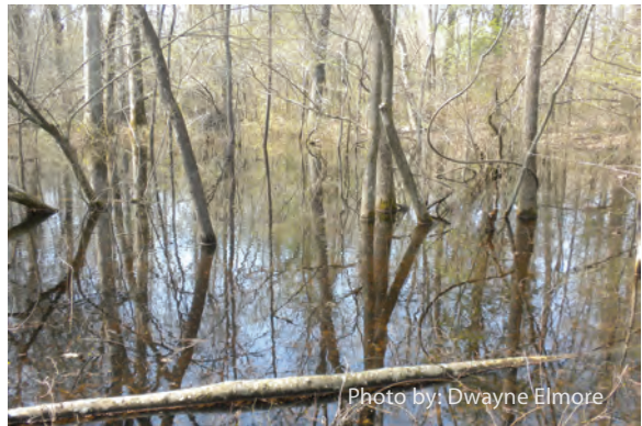
Green tree reservoirs harbor abundant aquatic invertebrates, acorns and other hard mast, which are excellent winter food sources for ducks. Waterfowl also use these areas for roosting cover.

Green tree reservoirs are bottomland forests or woodlands that are flooded in the fall when trees are dormant to encourage waterfowl to utilize mast, such as oak acorns. Additionally, green tree reservoirs contain abundant aquatic invertebrates in late winter that are important foods for waterfowl.