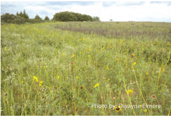
This food plot was created by disked a firebreak around shiner oak habitat in western Oklahoma. Notice the sunflower, croton (doveweed), and ragweed which provides forage for deer and seed for dove and northern bobwhite.

Managing native vegetation with prescribed fire should be an integral part of any land management plan. Information about developing and implementing a prescribed fire program on your property can be found in several OSU Cooperative Extension publications and videos including: Fire Prescriptions for Maintenance and Restoration of Native Plant Communities (NREM-2878), Using Prescribed Fire in Oklahoma (E-927 and video VT112), The Effects of Fire (VT1139), Patch Burning: Integrating Fire and Grazing to Promote Heterogeneity (E-998), Burning in the Growing Season (E-1025) and several others. See Relevant Publications and Suggested Readings on page 63 for information on how to obtain these resources. Firebreaks, especially those that are mowed or tilled, and roadsides may be the only accessible and open areas for food plots in some circumstances (e.g. in forested areas or in native untilled prairie). Firebreaks can be disked annually or seasonally and used for warm and or cool-season annual food plots.